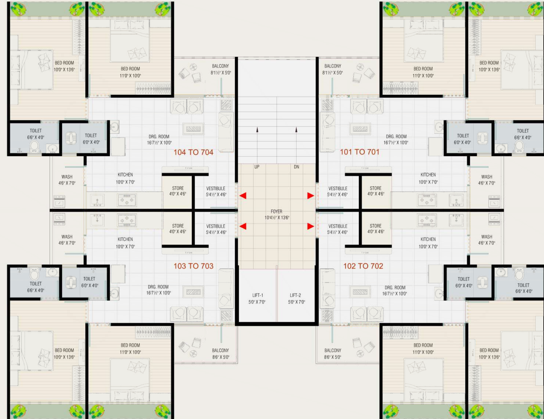
BLOCK - A TYPICAL PLAN