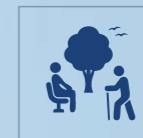
Dedicated Area for Elder persons