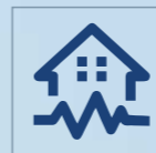
Earthquake Resistant Structure