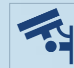
3 Tier Security