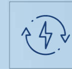
24x7 Power Backup