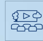
Open Air Theatre & Amphitheatre