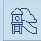
Kids Play Area With Rubberized Landing Floor