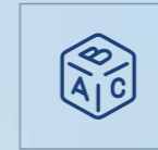
In House Creche/ Nursery School