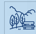
Landscaped Green Parks