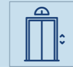
Lifts With ARD System