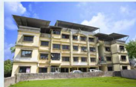
JINAL APARTMENTS Chinchpada, Pen