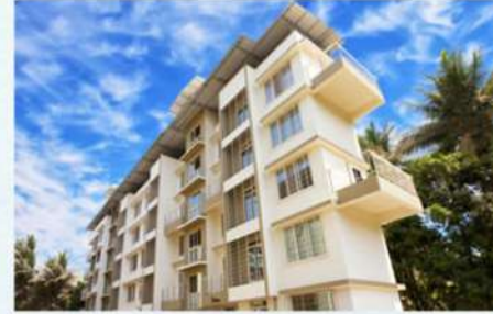
OASIS Chinchpada, Pen