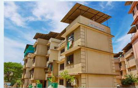
SUMEET COMPLEX Motiram Talao Road, Pen