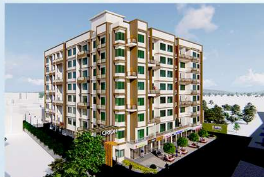
THE ORION Chinchpada, Pen