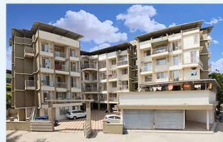
ISHANYA Chinchpada, Pen