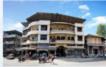
PRACHI COMPLEX Chawadi Naka, Pen