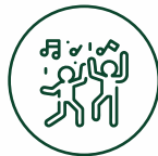
SATSANG/KITTY PARTY ROOM