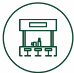
OPEN KITCHEN AREA