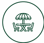
SNAKES & LADDERS