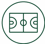
MULTI PURPOSE COURT