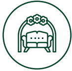
BANQUET HALL 2