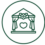
BANQUET HALL 1