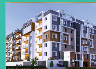
Boppana's Sankalp Casa, Prasadampadu, Vijayawada