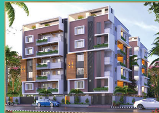
Boppana's Square, Sree Durga Estates, Tadapalli