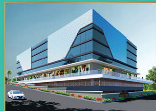
Boppana's Sentral, Chandanagar, Hyderabad