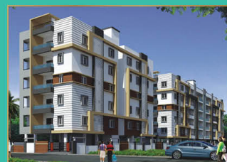
Boppana's Valluru Empire, Vijayawada