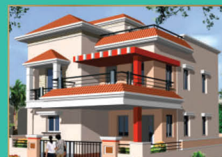
Boppana's PVR Meadows, Mallampet, Hyderabad