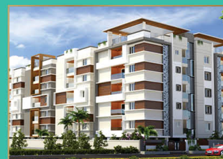
River side, Thadepally