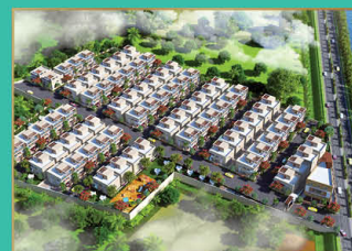
Lake view villas, Thadepally