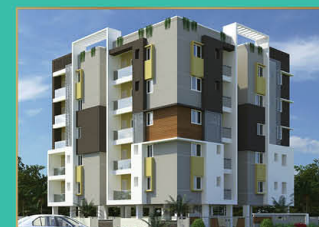
Boppana's Sairam Residency, Gudivada