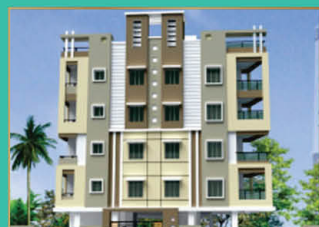
Boppana's A4 Lounge, Kondapur, Hyderabad