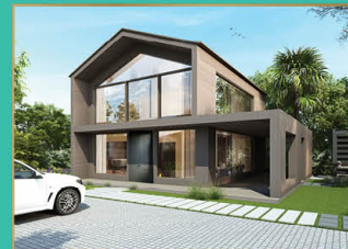
Boppana's Lake Wood, Hyderabad