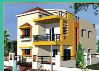
Boppana's KVR Paradise, Bachupally, Hyderabad