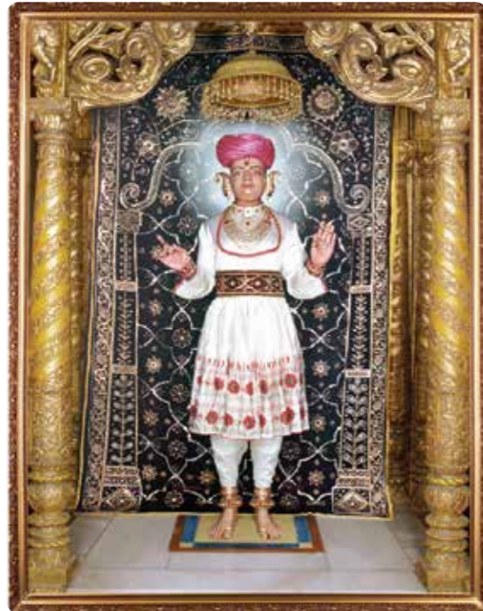
BHAGWAN SRI SWAMINARAYAN