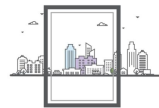
Unobstructed view through glass