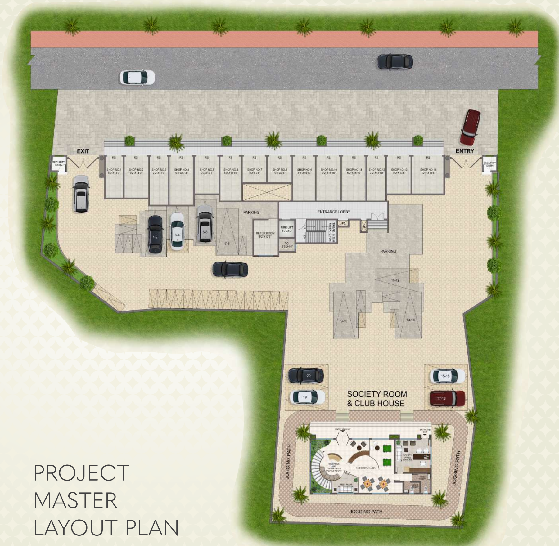
PROJECT MASTER LAYOUT PLAN