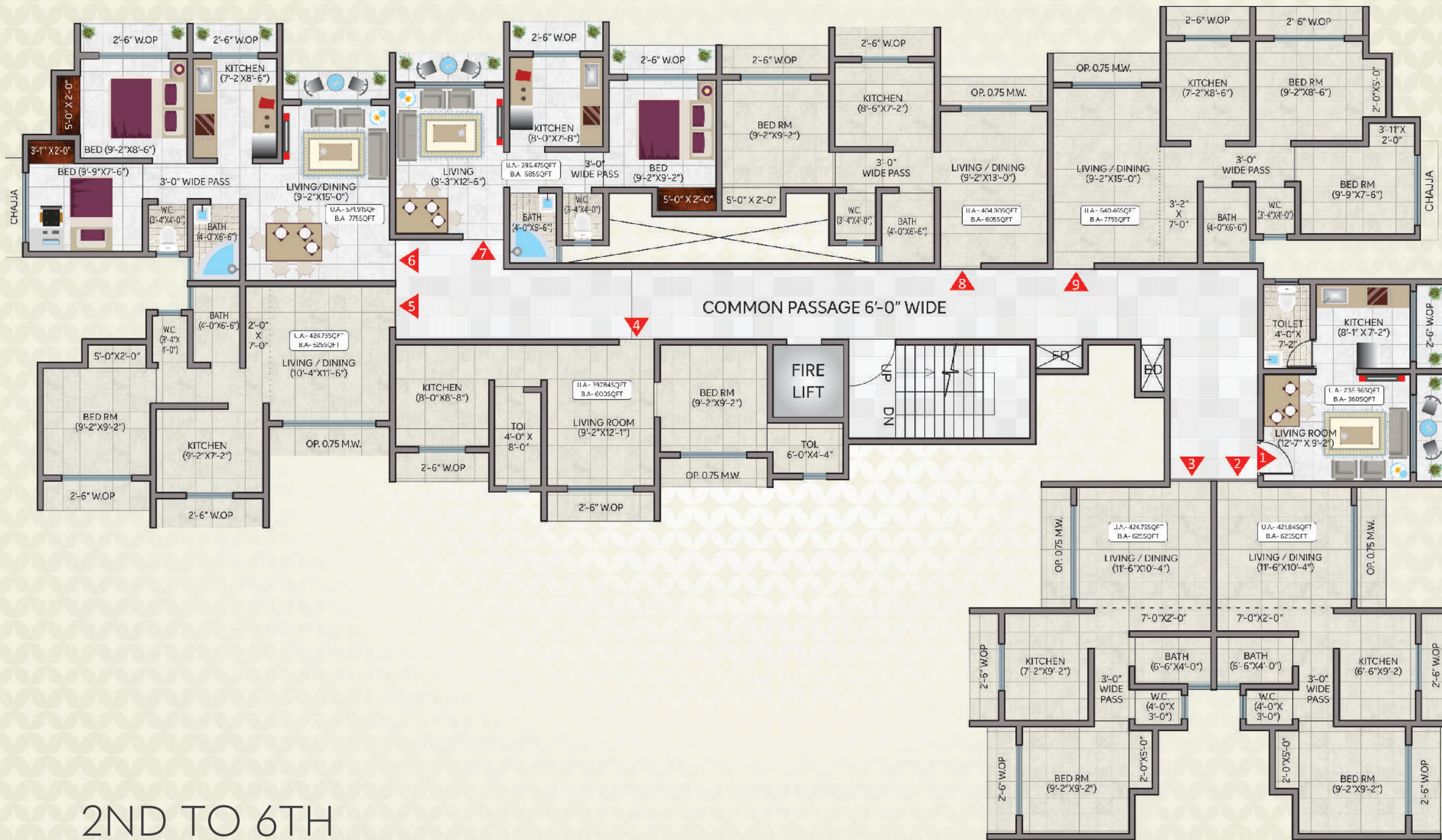
2ND TO 6TH TYPICAL FLOOR PLAN