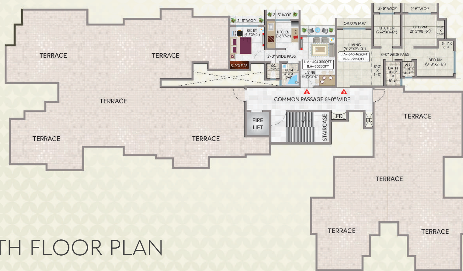
7TH FLOOR PLAN