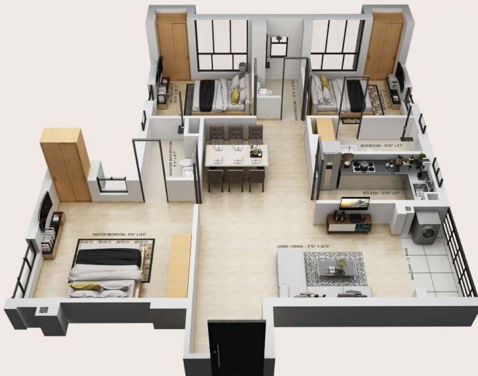
ARIA - E