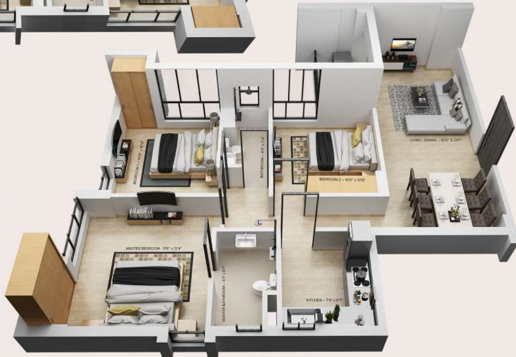
ARIA - D