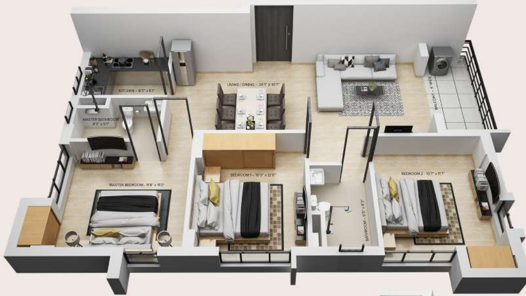
ARIA - C