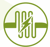
Underground Electric Network