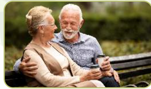
SIT OUT AREA