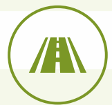
Internal Cement Road