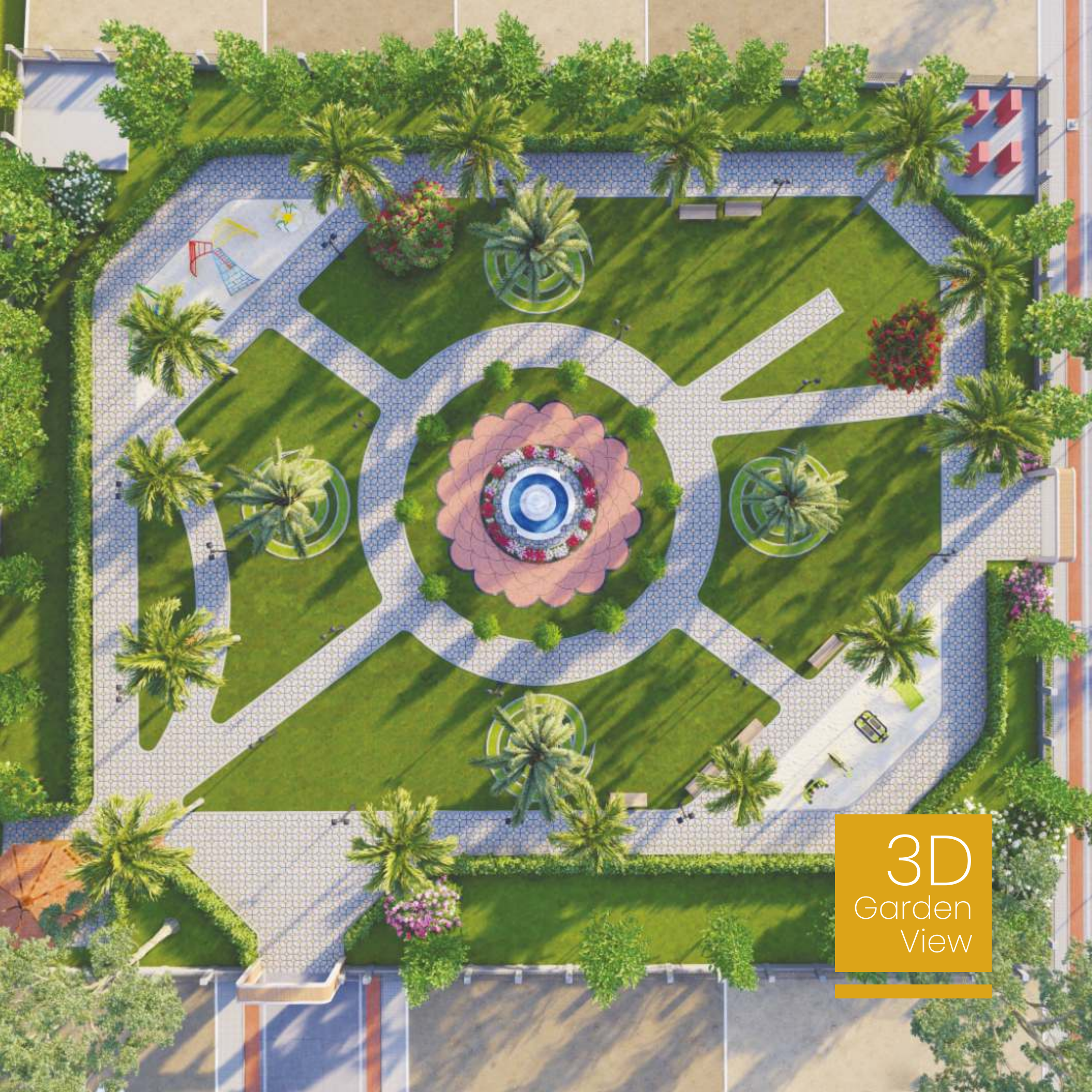
3D Garden View