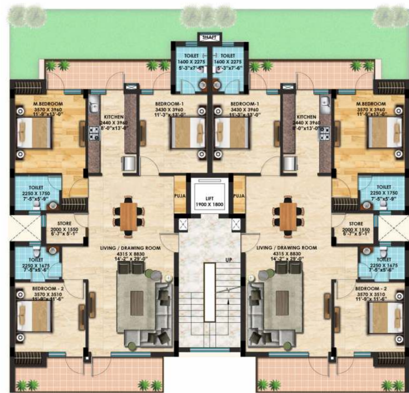
Unit No. 101, 201, 301