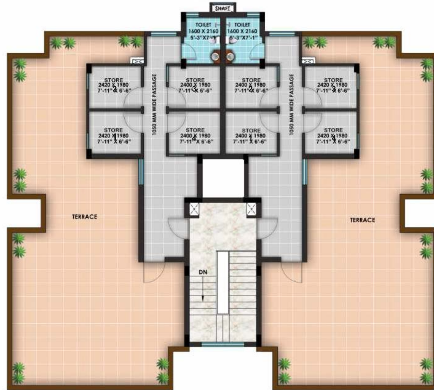
Terrace Plan (on fourth floor)

Store 1, 2, 3 & 4 will be allotted respectively to ground floor, 1st floor, 2nd floor and 3rd floor.