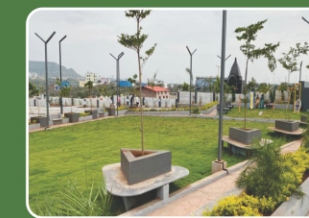
Play Ground & Garden