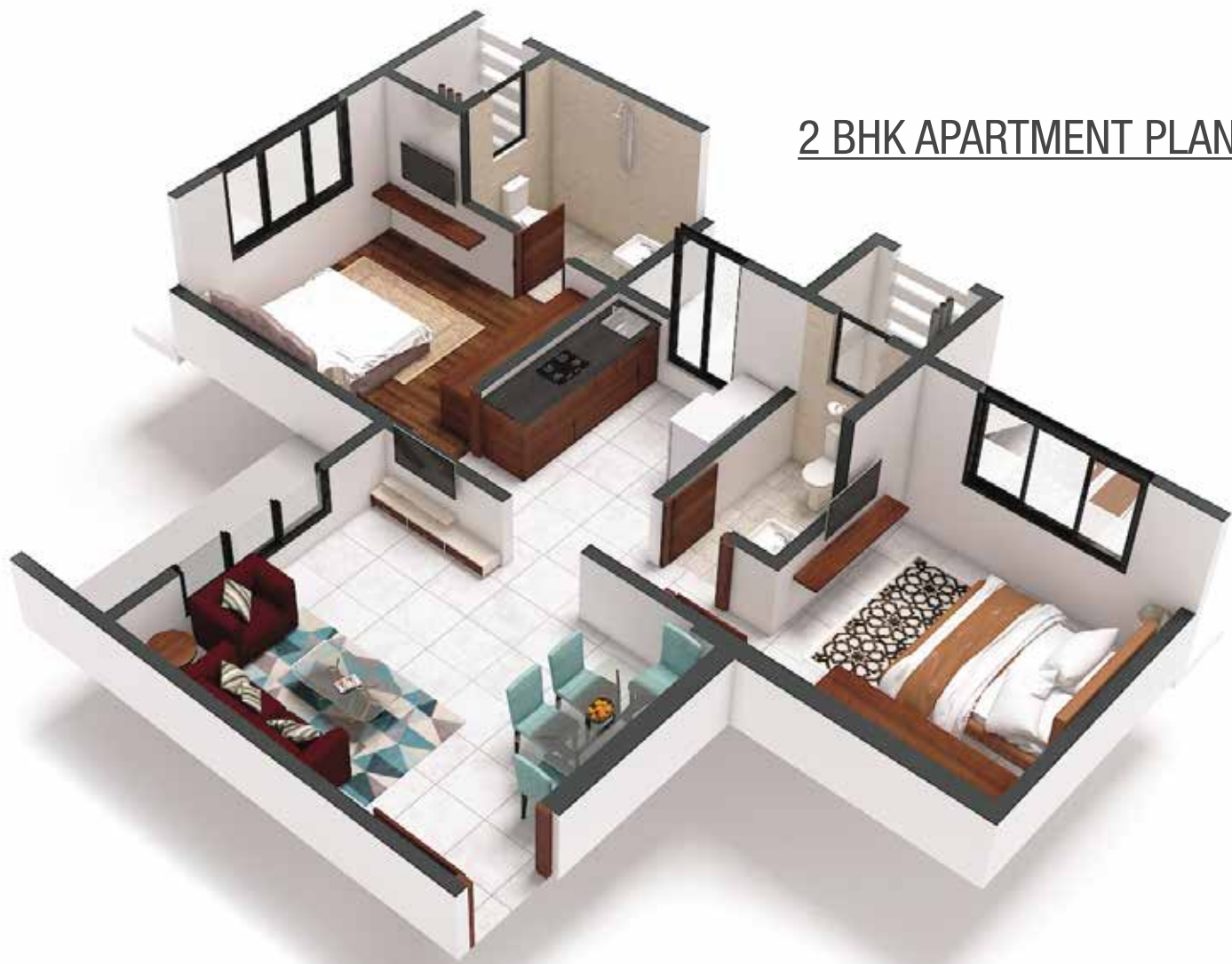
2 BHK APARTMENT PLAN