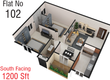
South Facing 1200 Sft