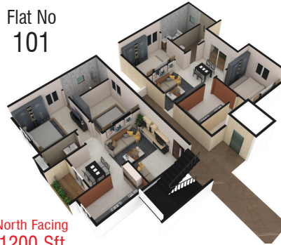
North Facing 1200 Sft