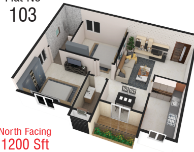
North Facing 1200 Sft