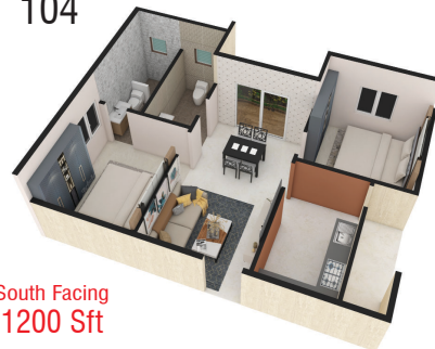
South Facing 1200 Sft