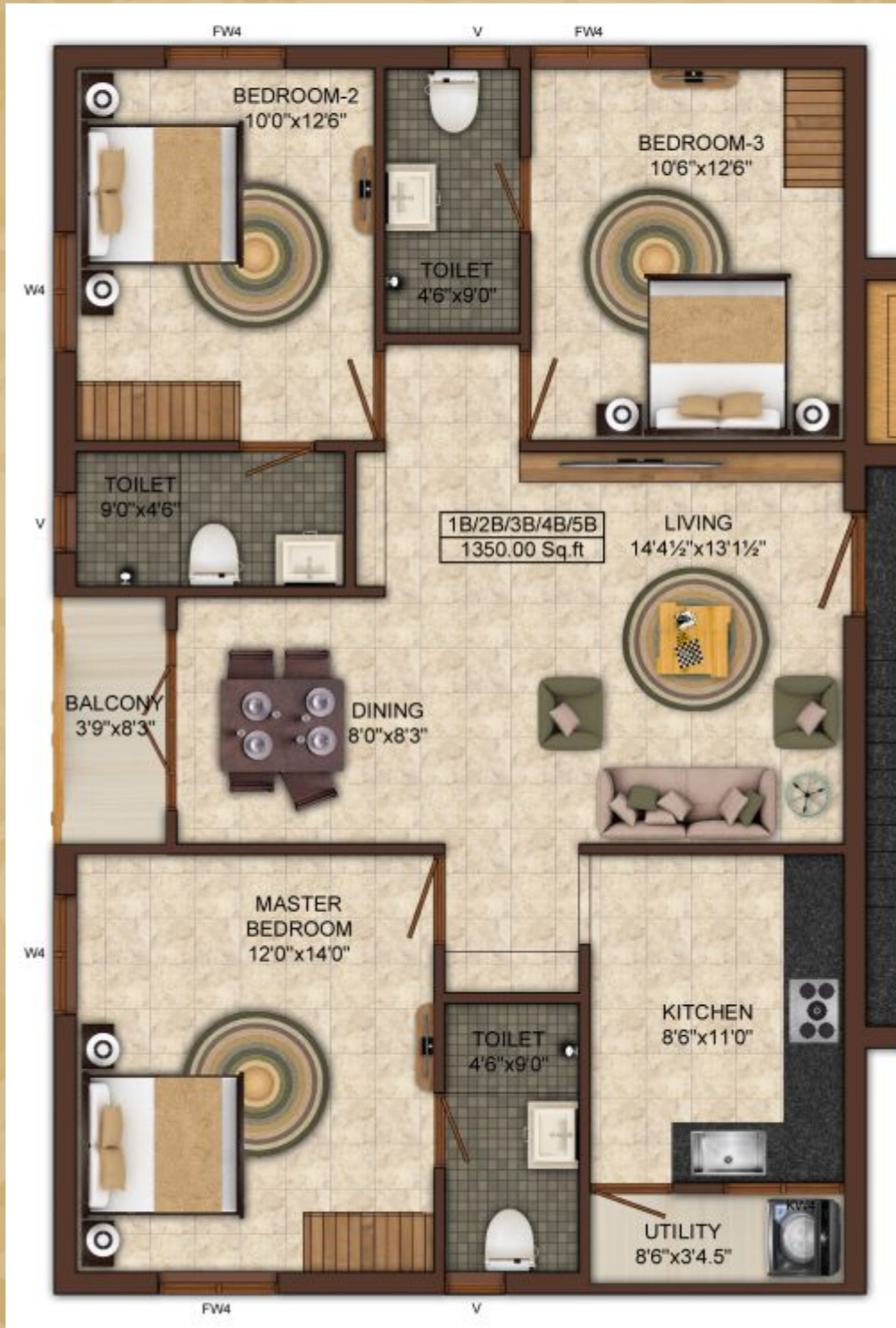
Typical Floor Plan - I,II, III, IV, V