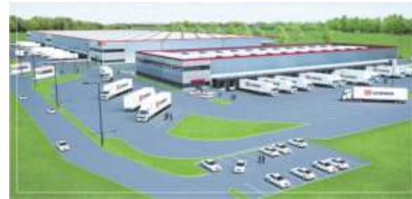
Mangalpalli Logistic Park (Published in AJ)