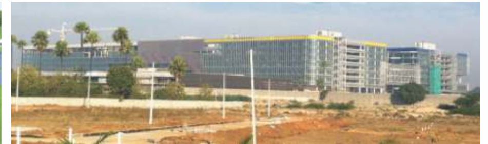
Tata Consultancy Services