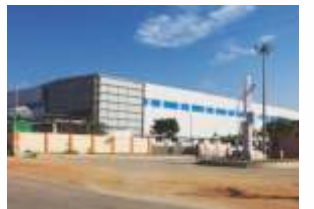
Tata Aerospace SEZ