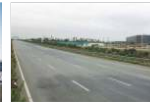
Outer Ring Road