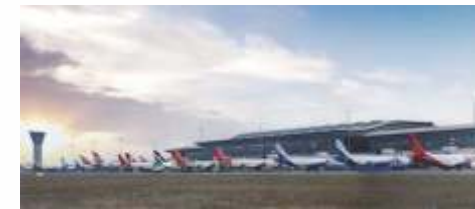
Shamshabad International Airport