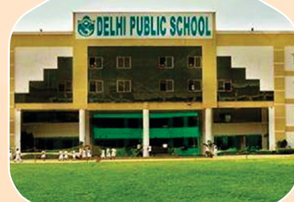
Delhi Public School