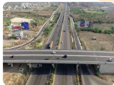
OUTER RING ROAD Exit No. 10 & 11