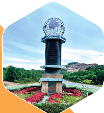
MSME Green Industrial Park