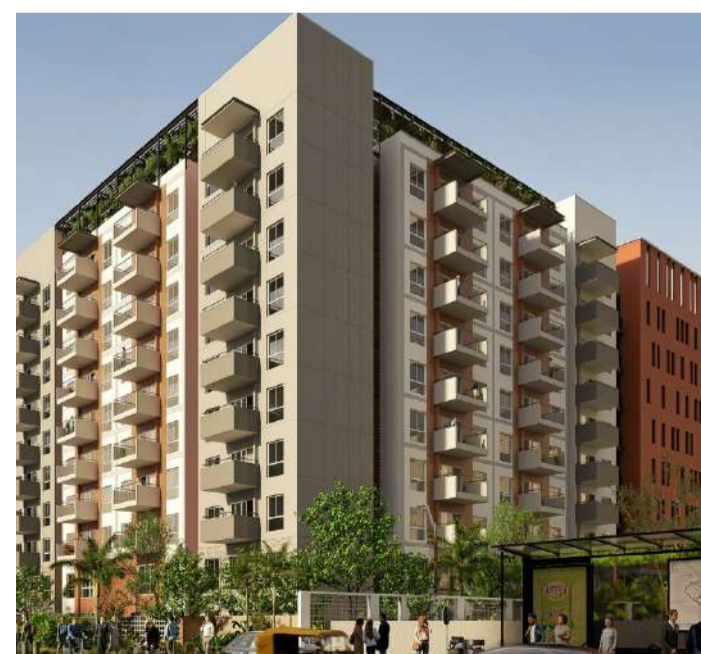
Y@WHITEFIELD 3L SQ FT