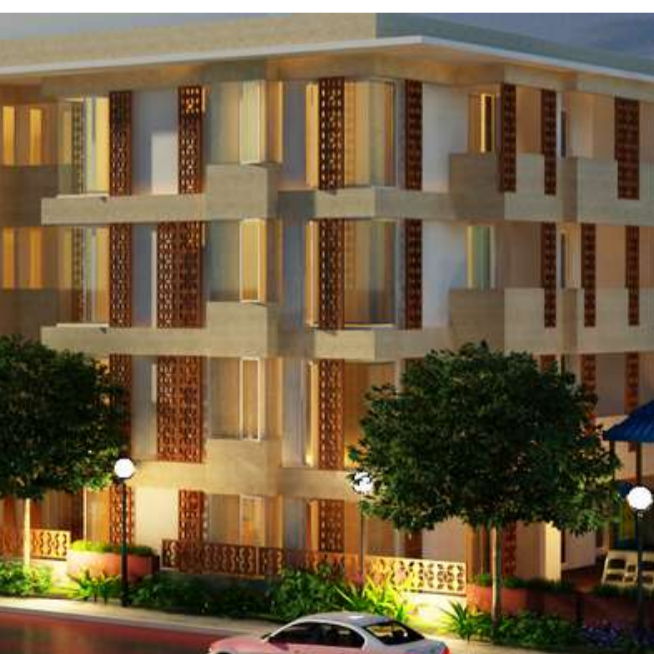
ORCHARD IN BLOOM 0.6L SQ FT