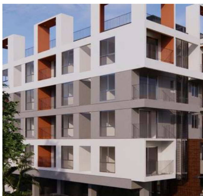
Y@CV RAMAN NAGAR 0.4L SQ FT