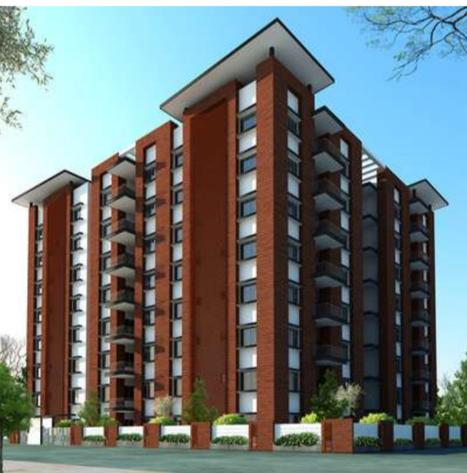
LEAFY BLOCKS 1.1L SQ FT

Inner Spaces is a Bangalore based real estate development firm founded in 2011. Their goal is to build you a home for today and an investment that lasts for decades to come. Inner Spaces builds unique customer centric smartly designed boutique properties. Their holistic approach to crafting lifestyles focuses on functionality and the quality of everything that they do. Values of honesty and trust are keystones to building relationships with clients. Inner Spaces takes pride in the passionate drive to create bespoke experiences that are delivered on time.