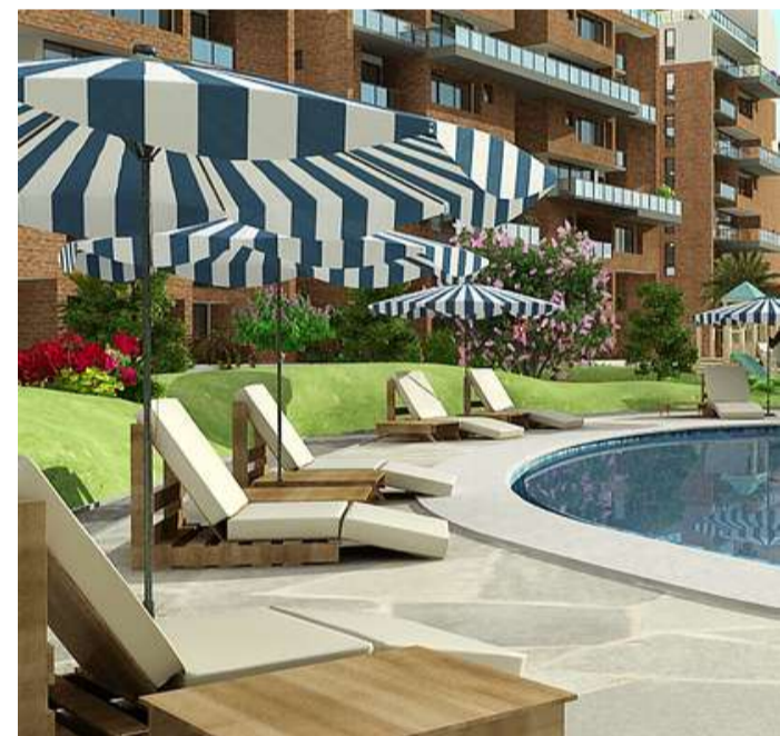
MEADOW IN THE SUN 6.6L SQ FT