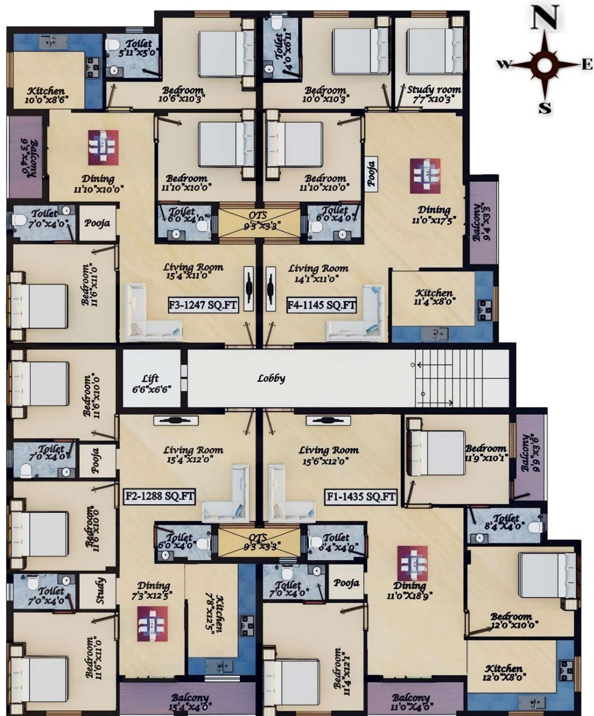
TYPICAL FLOOR PLAN (AREA IN SQ.FT)