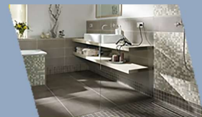
ANTI-SLIPPERY TILES FOR TOILETS