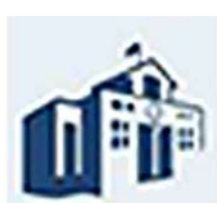
School & College