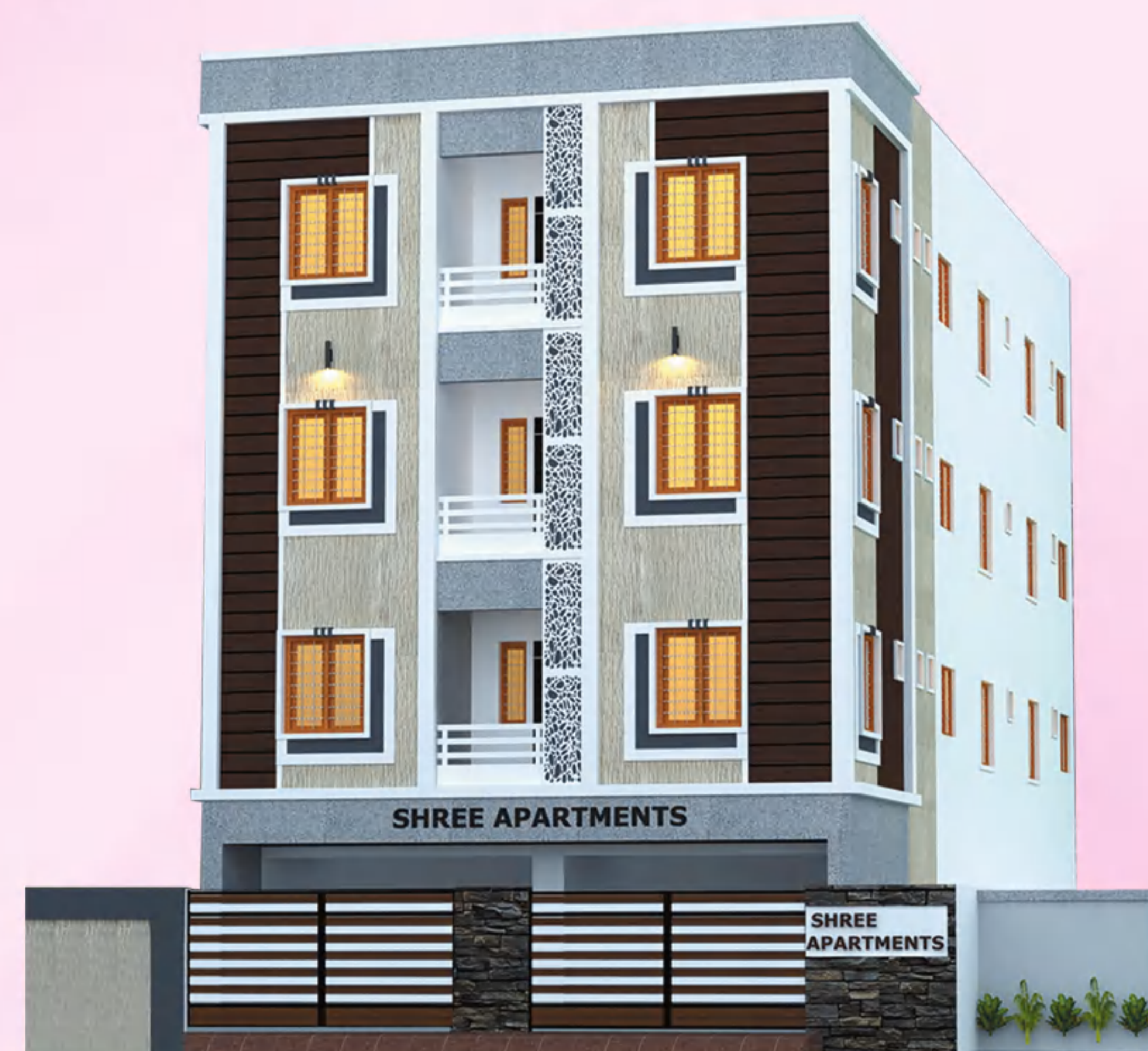
SHREE APARTMENTS BINNY COLONY