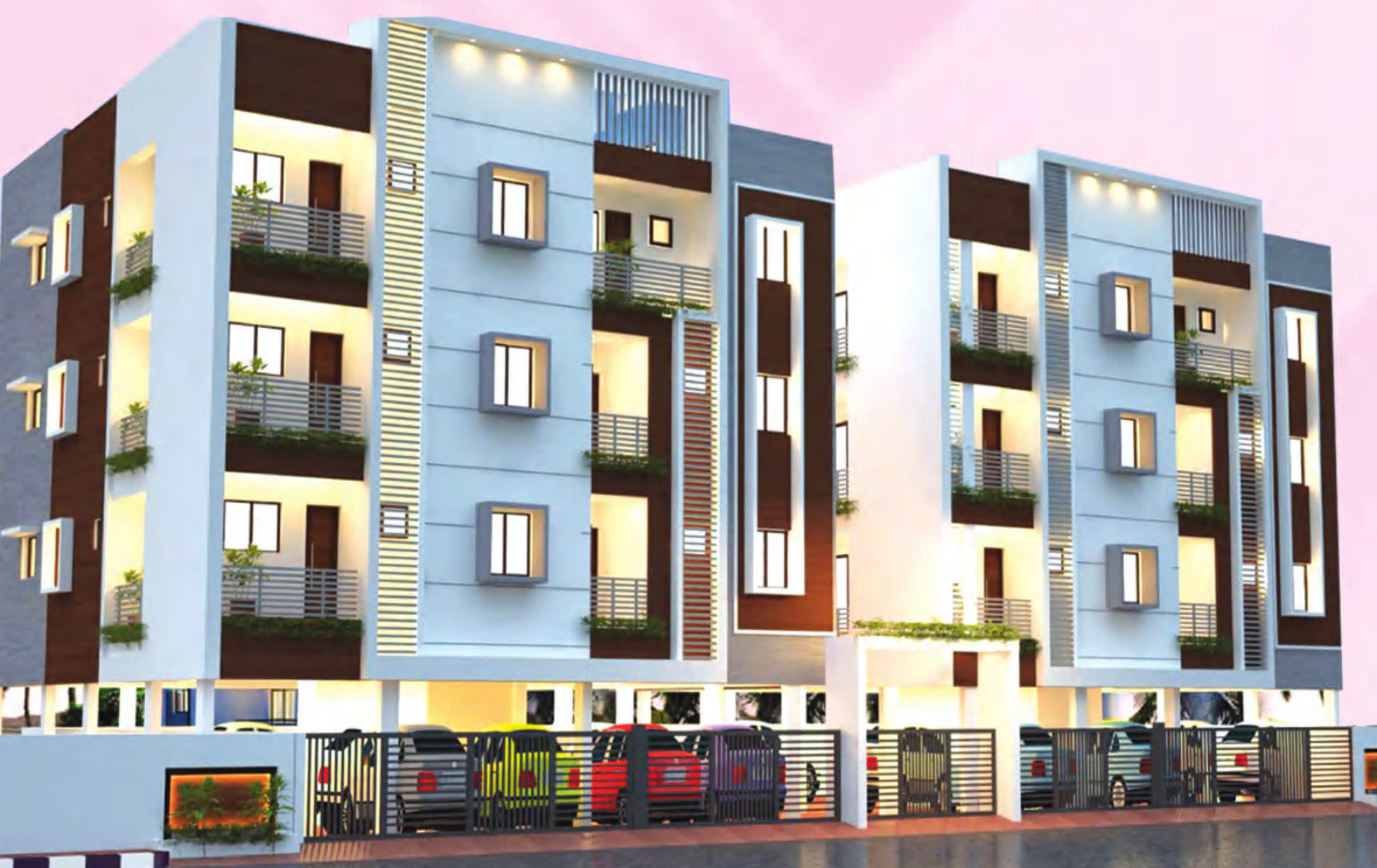
SHRI GUGA APARTMENTS M.R. NAGAR