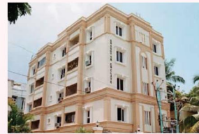
Bhaggyam Enclave, Saidapet