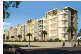
Bhaggyam Auramills, Thoraipakkam