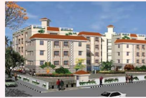
Bhaggyam Elite, Perungudi.