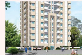
Bhaggyam Lakeshore, Keelkatalai.