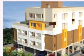
Bhaggyam Suraksha, Medavakkam