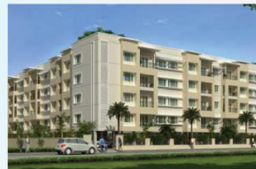
Bhaggyam Urbanville, Thoraipakkam