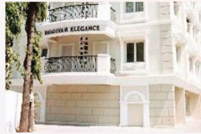
Bhaggyam Elegance, Mylapore.