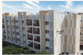
Bhaggyam Criha, Thoraipakkam