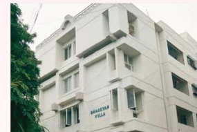
Bhaggyam Villa, Mylapore.