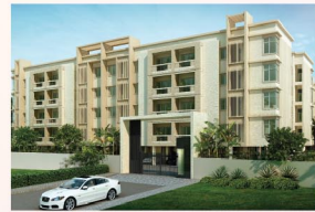
Bhaggyam Srishti, Sholinganallur