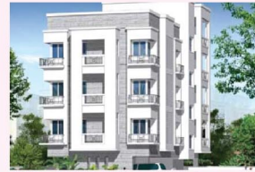
Bhaggyam Serene, Anna Nagar