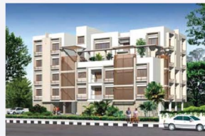
Bhaggyam Bala Vilas, Mylapore.