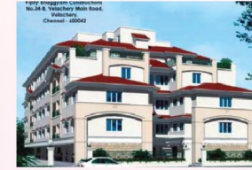
Bhaggyam Residency, Velachery