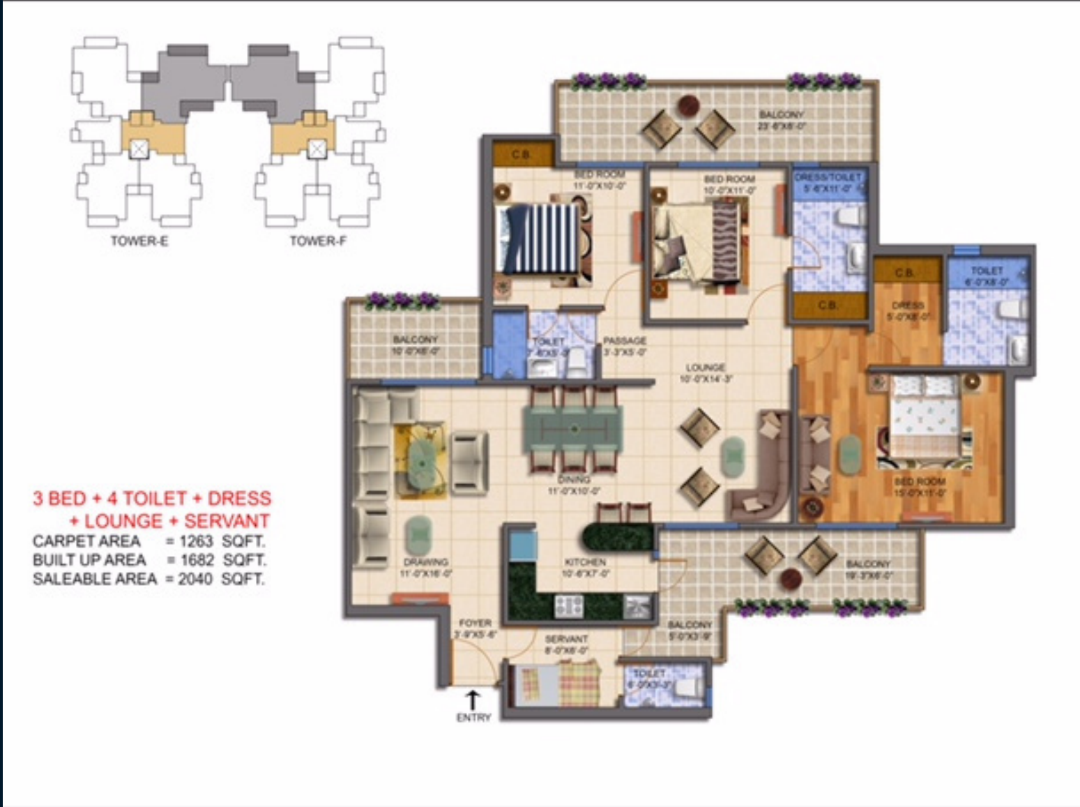
3 BHK ( 2040 Sq. Ft )