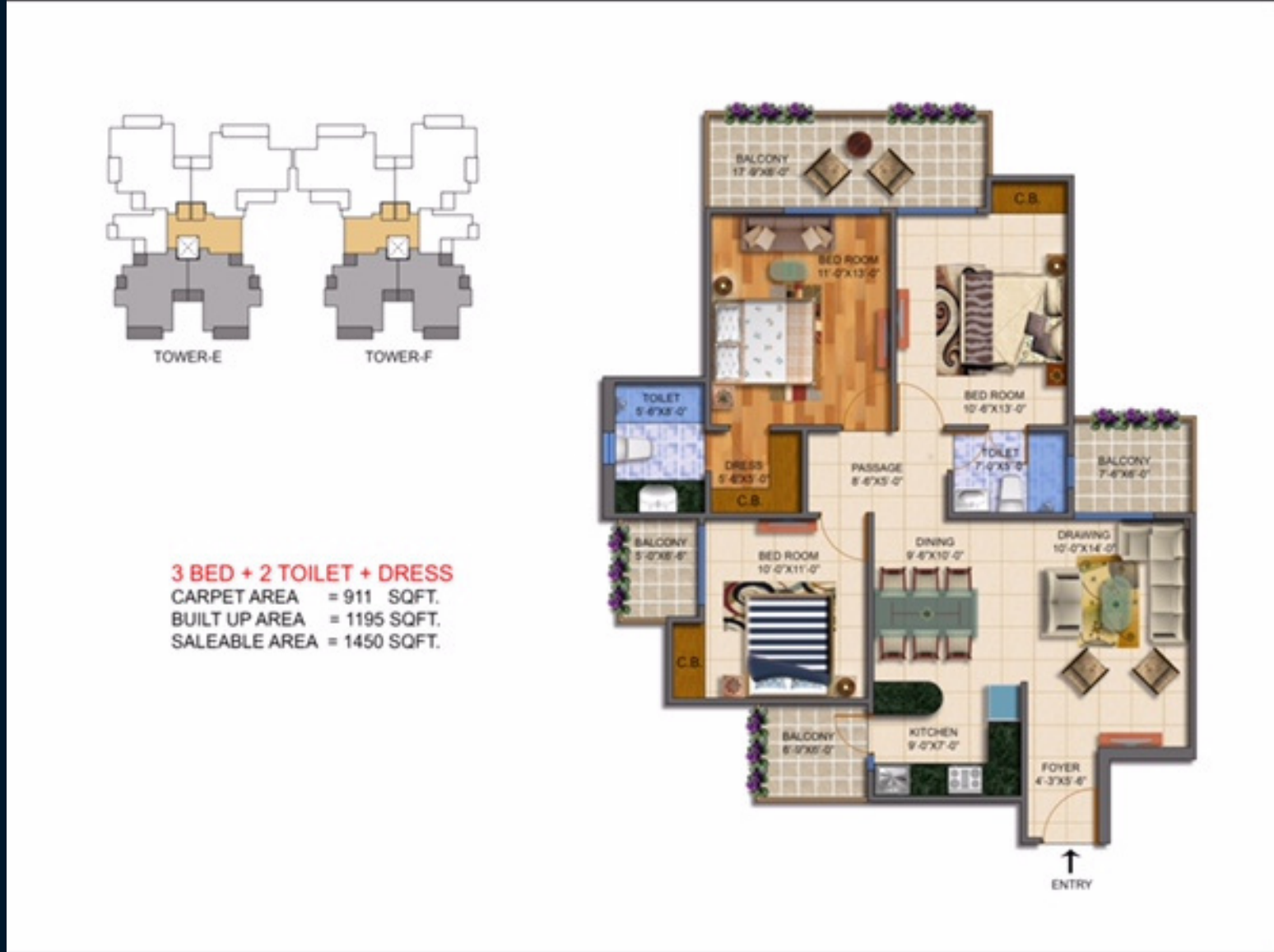
3 BHK ( 1450 Sq. Ft )