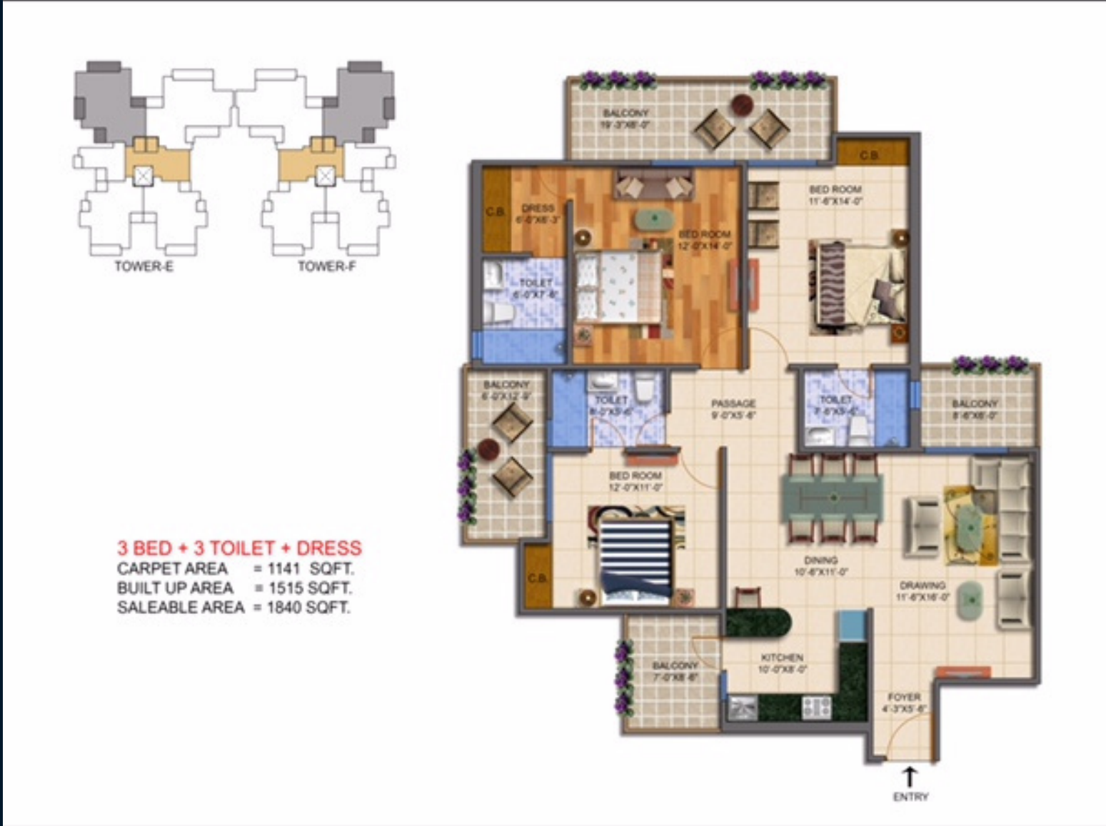
3 BHK ( 1840 Sq. Ft )