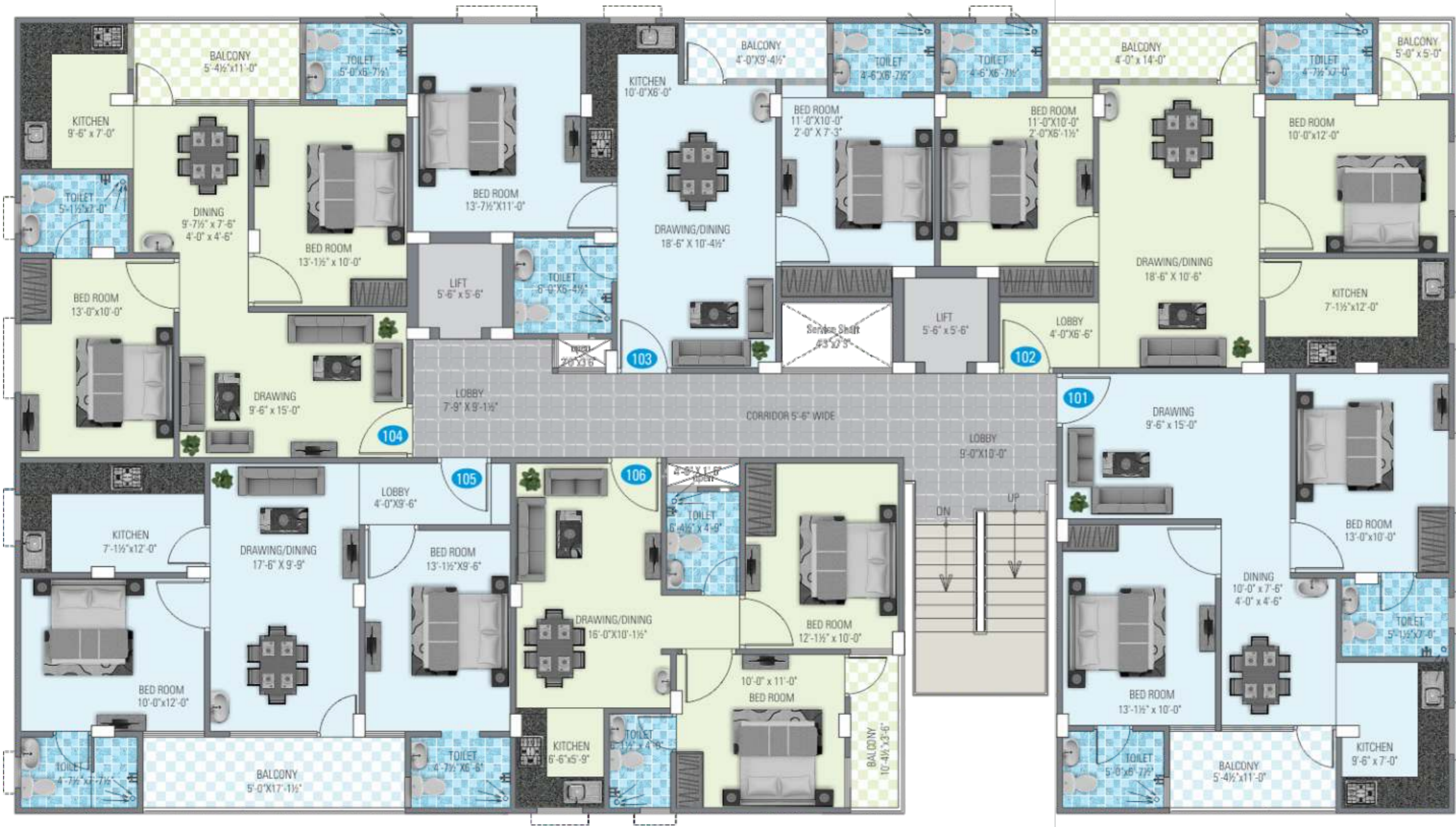
Apartment Type 1