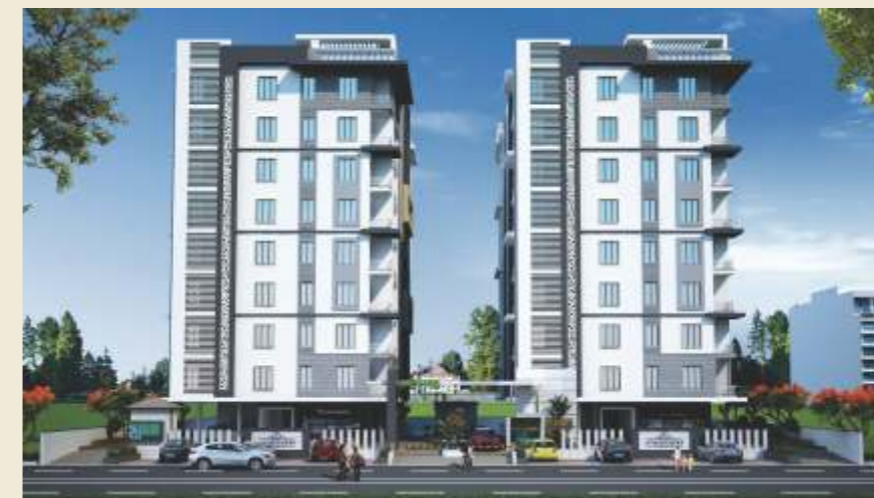
Site : Plot No. E-1128-1129, Paldi Parsa, SEZ, Ajmer Road, Jaipur