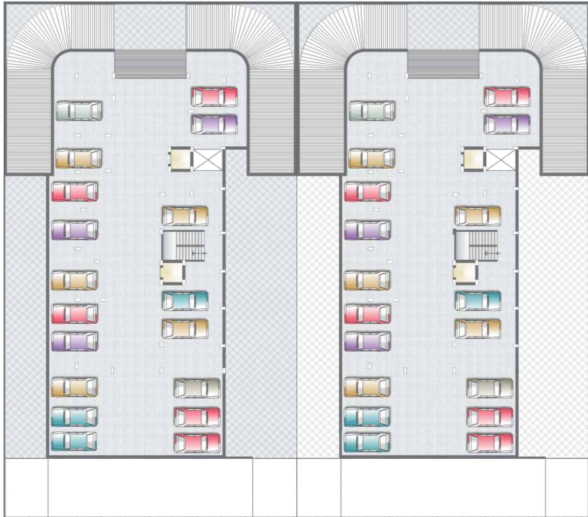
Basement Floor Plan