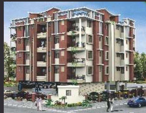
Vedic Aashyra, Narayan Vihar