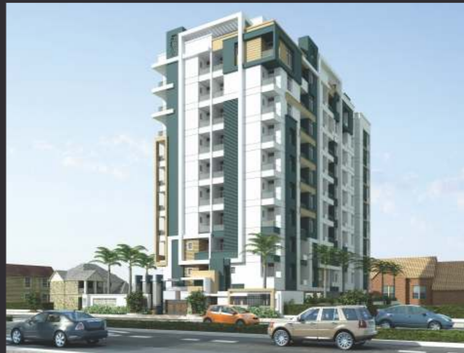
Atmosphere Prime, near SEZ, Ajmer Road Jaipur