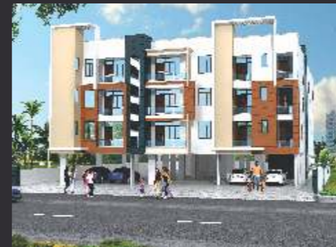
Karmyogi, Vaishali Nagar, Jaipur