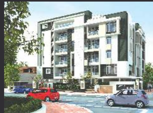
Vedic Homes, Narayan Vihar, Jaipur