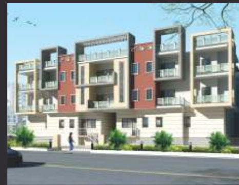
Bharat Residency, Vaishali Nagar