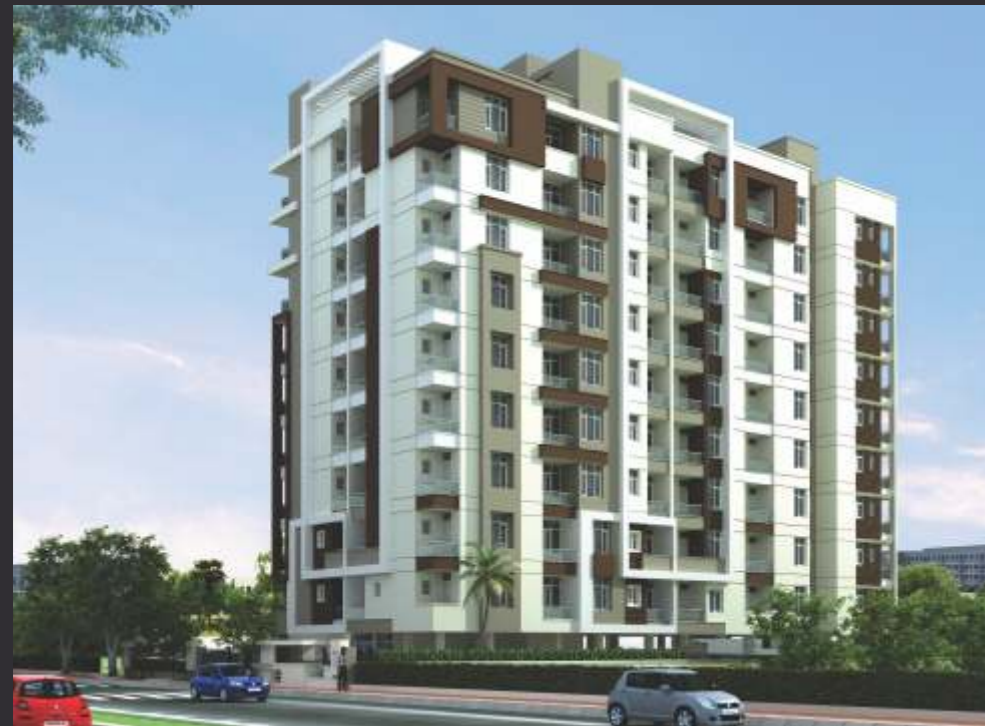
Atmosphere, SEZ, Ajmer Road, Jaipur

It's a group of highly experienced professionals from the realty sector. They collectively possess the same vision and mission to pursue their common goal. Samanvay Group has firm commitment towards providing high quality urban housing to the people who are more career-oriented since they get less time to invest for buying household goods. Their experience of over a decade will definitely have an edge over others in the realty sector.