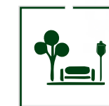
Sit Out Area