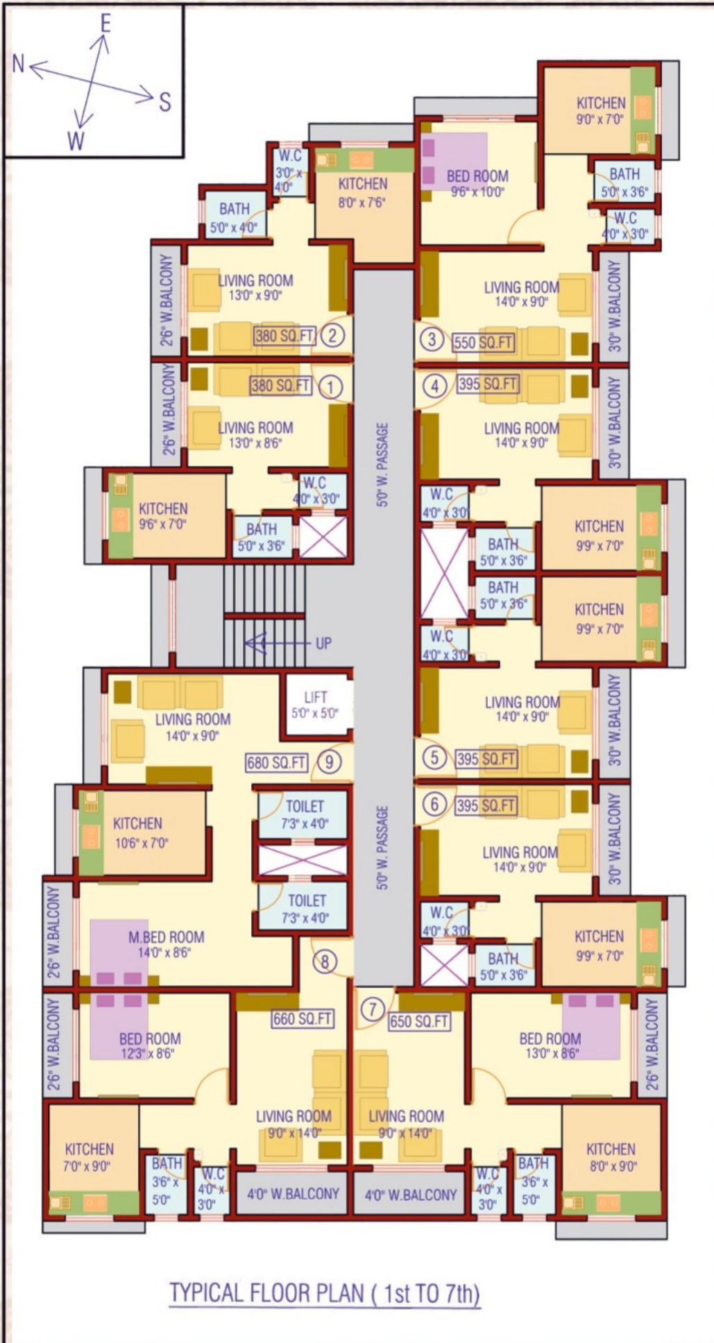
TYPICAL FLOOR PLAN ( 1st TO 7th)

PRODUCED BY AN AUTODESK EDUCATIONAL PRODUCT