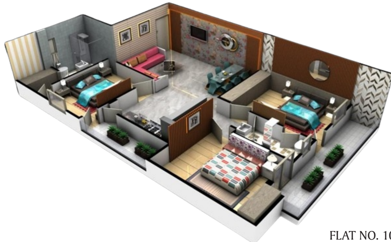
FLAT NO. 105