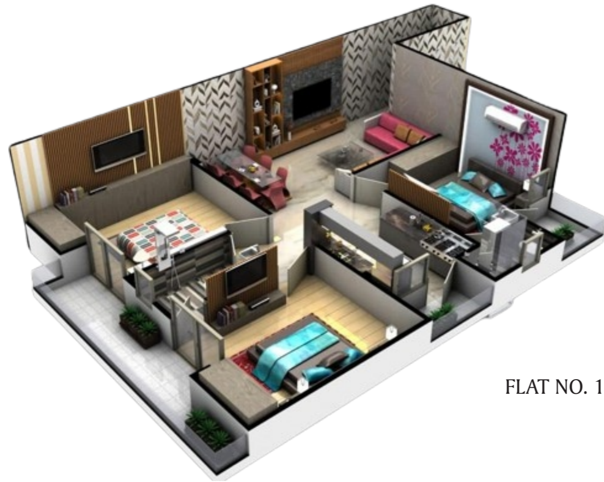
FLAT NO. 104