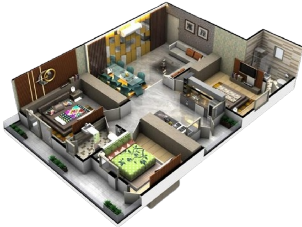
FLAT NO. 101