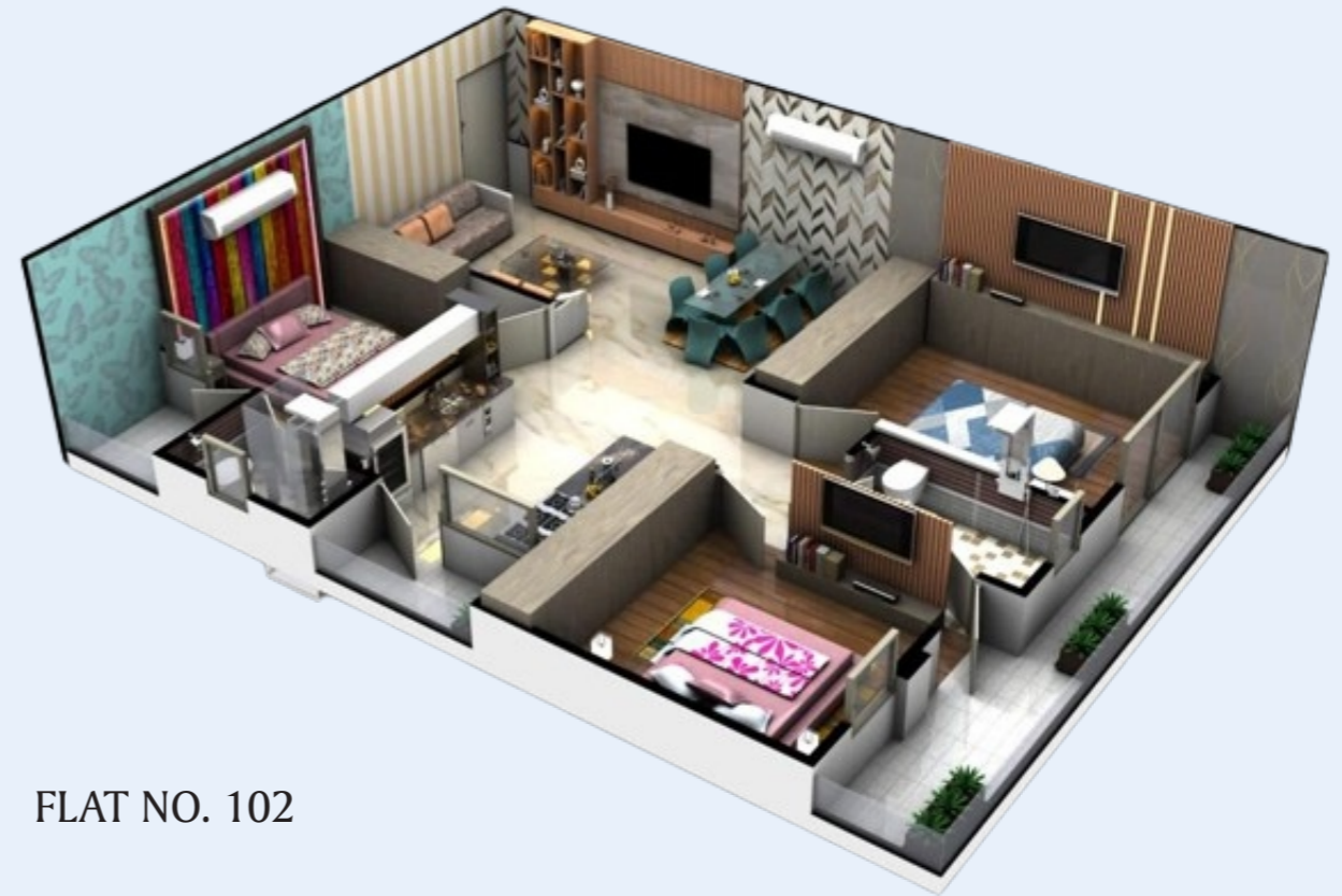
FLAT NO. 102