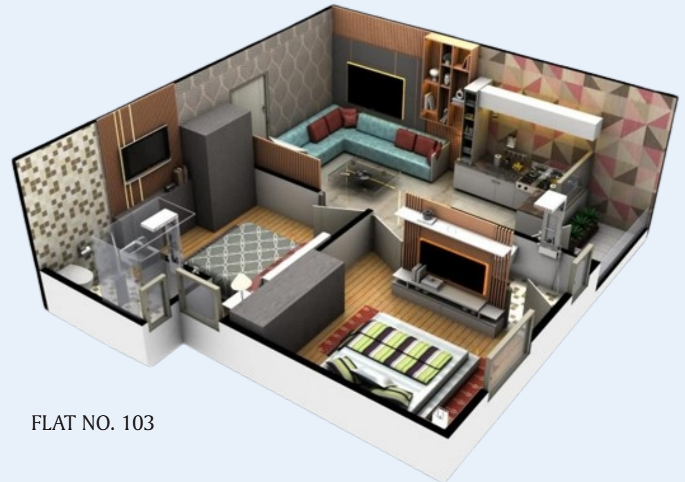
FLAT NO. 103