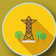
Electrification & Street Lights