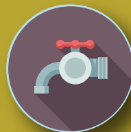
Piped Water-line to your home