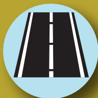
Wide Black-top Roads