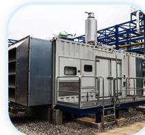
POWER BACK IN COMMON AREAS