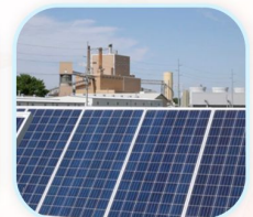
SOLAR POWER IN SPECIFIC COMMON AREAS