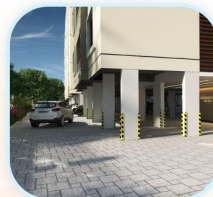
COVERED CAR PARK