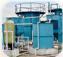
STP (SEWAGE TREATMENT PLANT)