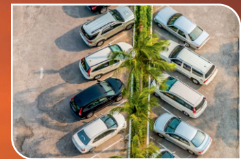
ALLOTTED CAR PARKING