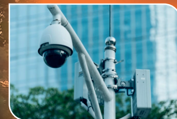
24X7 CCTV CAMERA SECURITY