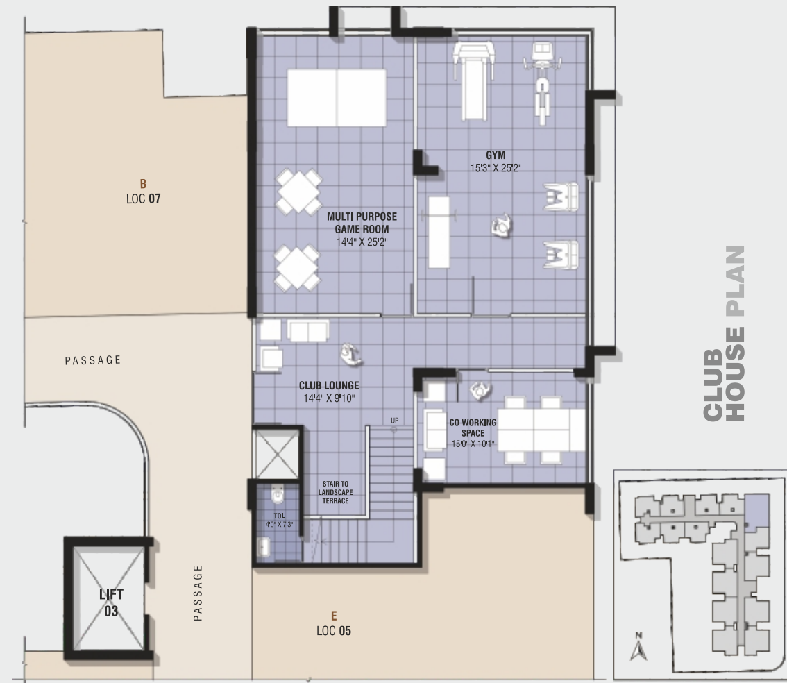
CLUB HOUSE PLAN