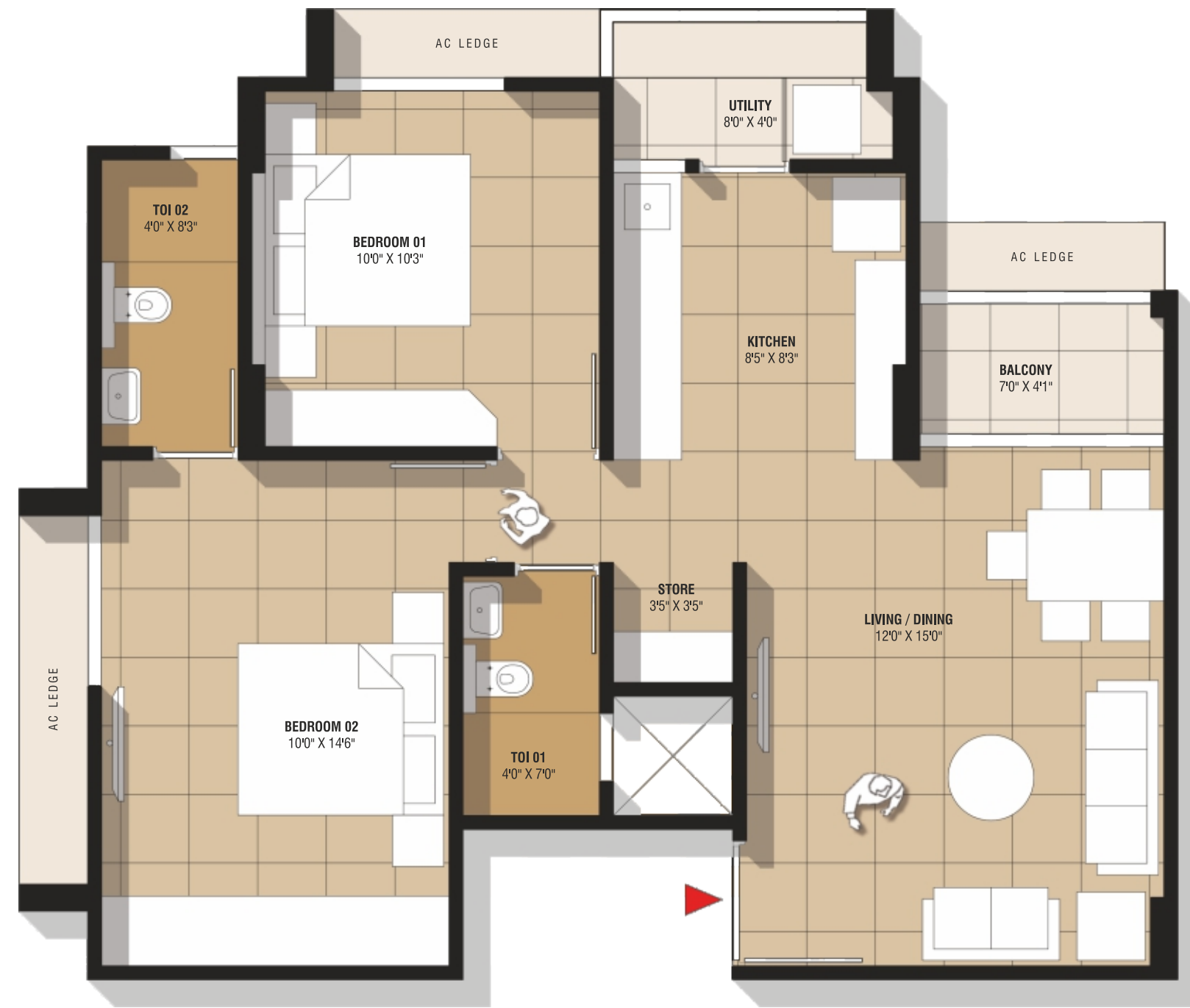
TYPE-A | 2 BHK+2T