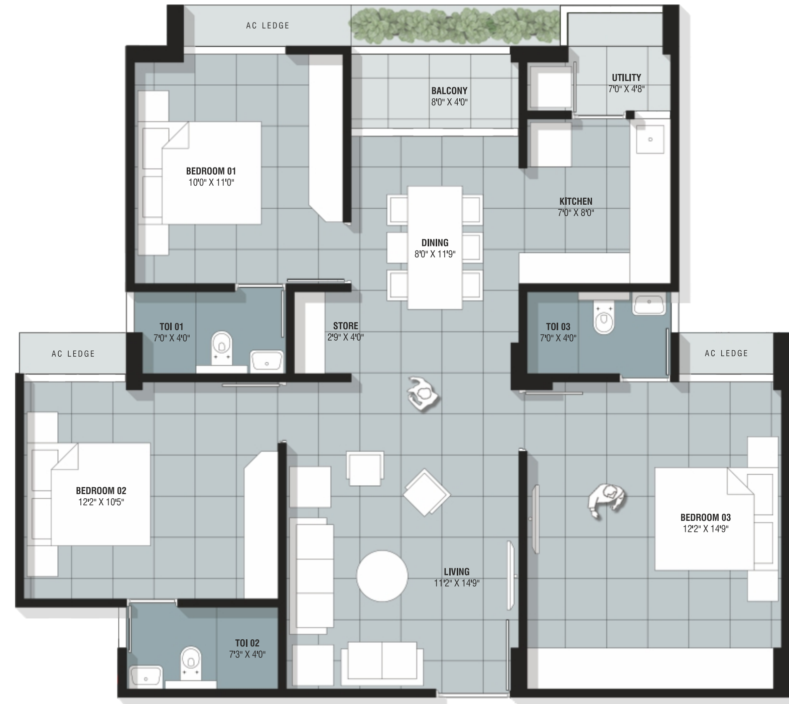
TYPE-E | 3 BHK+3T