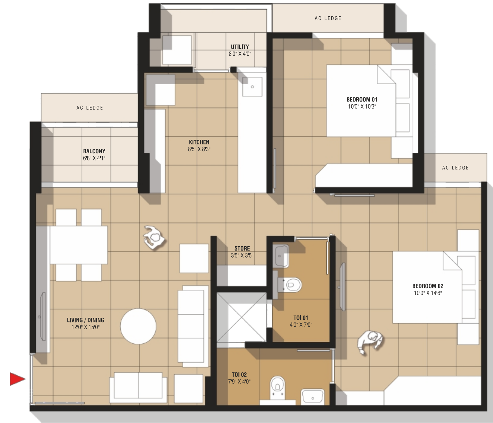
TYPE-B | 2 BHK+2T