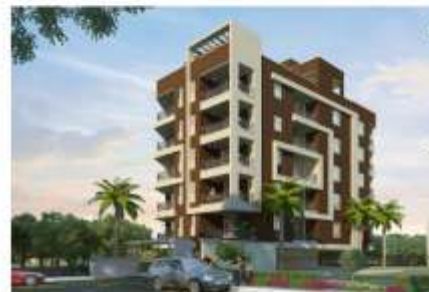
Radhey Niwas, Bapu Nagar, Jaipur