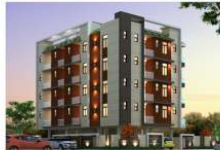
Mohan Heights, Vaishali Nagar, Jaipur