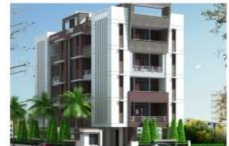
Om Enclave, Janta Colony, Jaipur