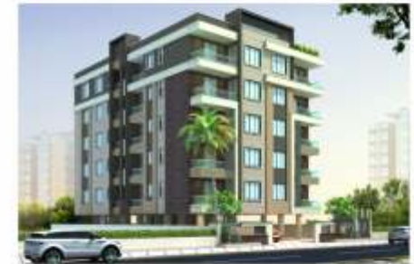
Om Residencey, C-scheme, Jaipur