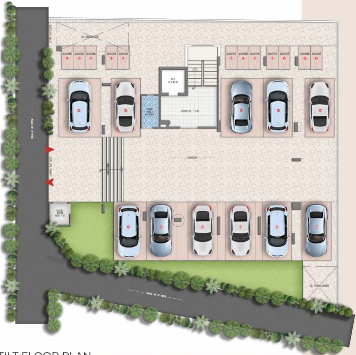
STILT FLOOR PLAN