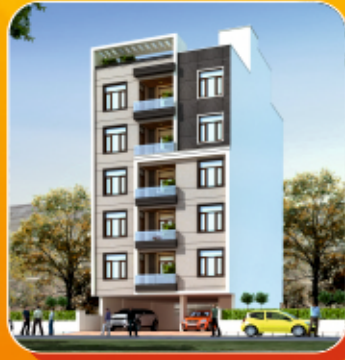
H R Residency Ajmer Road