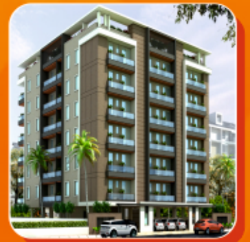
Parth Sun Shine Sodala