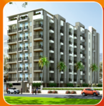
Parth Prime -2 Panchvati, Airport