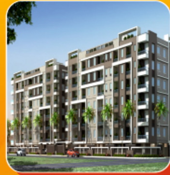
Parth Residency 5/6, Mansarover