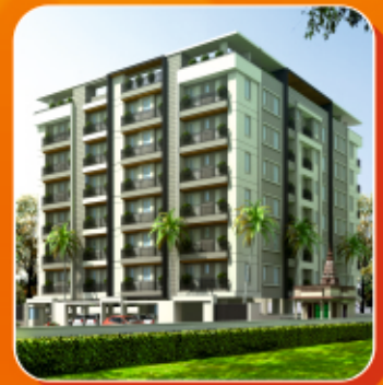
Parth Palace A/B Mansarover