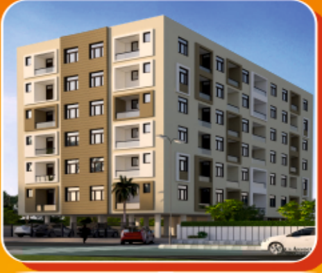
Parth Residency-2 Masarover