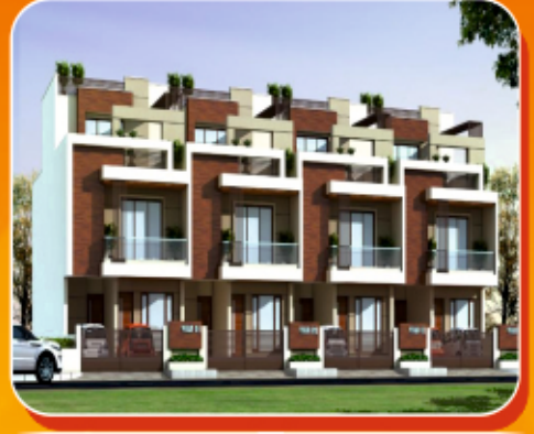
Parth Kothi Vaishali Nagar