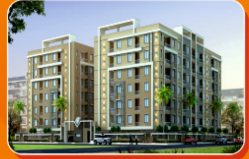
Parth Home Jagatpura