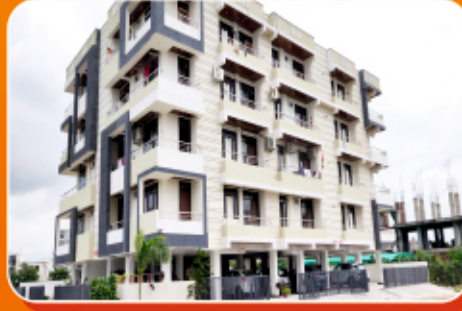
Parth Residency Mansarover