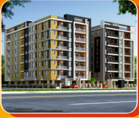
Parth Empire-1 Pratap Nagar