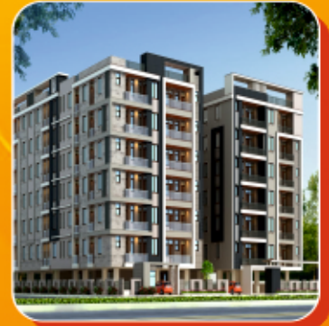
Parth Empire-2 Pratap Nagar