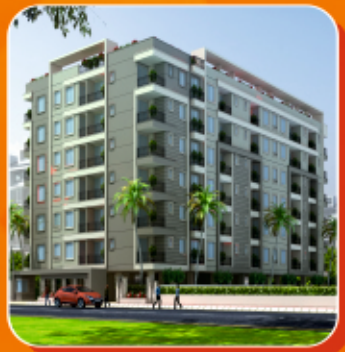
Parth Prime-1 Panchvati Airport