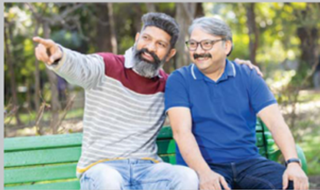
Senior Citizen's Zone