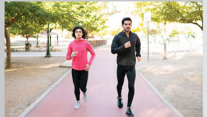
Jogging and Walking Space