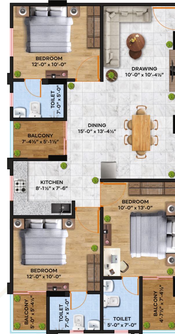
Flat No. - 110 (3 BHK) Super Built Up Area - 1453.20 Sq.Ft.