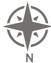
Flat No. - 103 (3 BHK) Super Built Up Area - 1480.75 Sq.Ft.