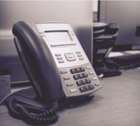
FTTH / MDU

At Signature tower we have made sure that you get faster speed and hassle free internet connectivity, for this "fiber-to-the-home" technology will be installed.