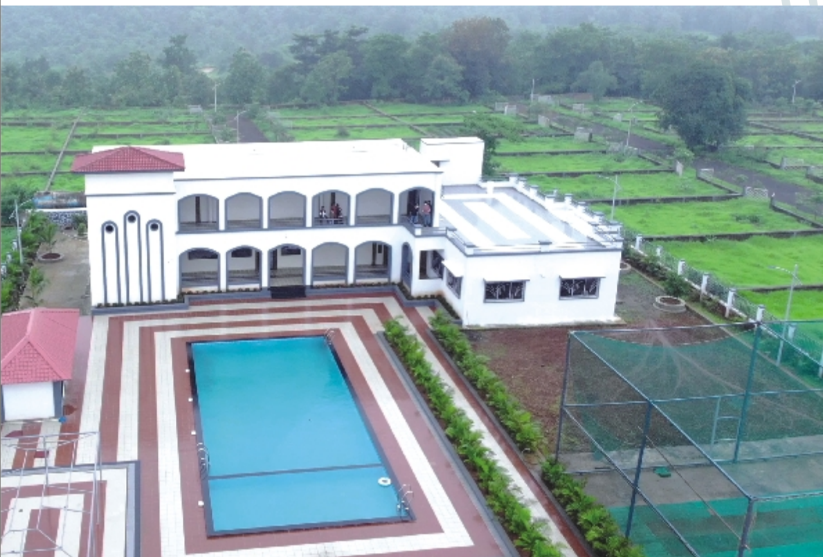
Actual Site Photo