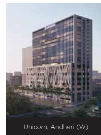
Unicorn, Andheri (W)