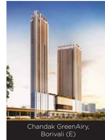
Chandak GreenAiry, Borivali (E)