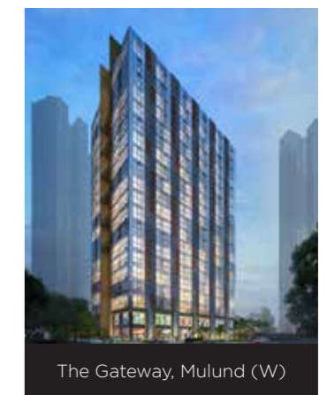
The Gateway, Mulund (W)