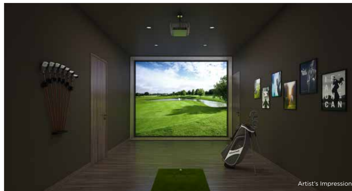
▶ VR Gaming Room