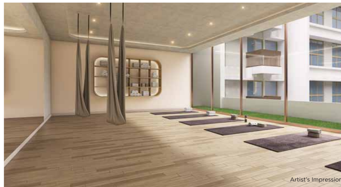
▶ Yoga Room