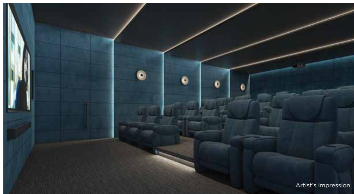
▶ Mini Theatre

45+* CURATED AMENITIES, SPREAD ACROSS ACRES OF JOYS AND DELIGHTS.