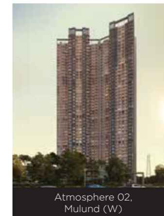
Atmosphere O2, Mulund (W)