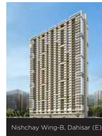
Nishchay Wing-B, Dahisar (E)