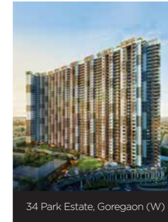
34 Park Estate, Goregaon (W)