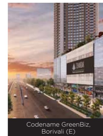
Codename GreenBiz, Borivali (E)