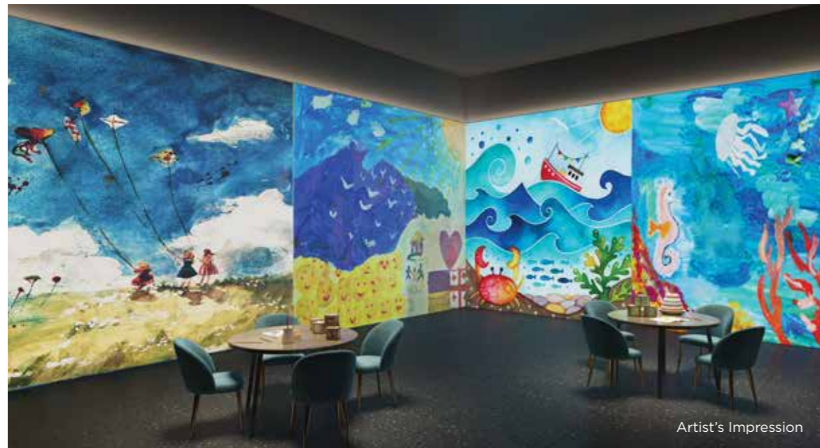
▶ Live Art Space