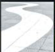
DRIVEWAY PAVING PATTERN