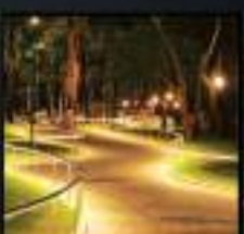
PATHWAY AROUND PLANTATION