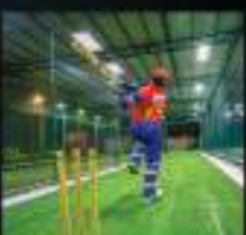
CRICKET NET COURT