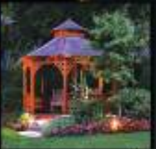
ELEVATED GAZEBO DECK