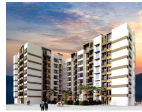
CROWN RESIDENCY 7 STOREY, 3 TOWERS, KAUSA (ON GOING PROJECT)