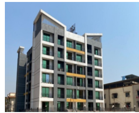
SAFFRON ENCLAVES 7 STORED TOWERS, MUMBRA STATION PROJECT COMPLETED (O.C. RECEIVED)