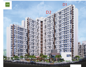
GRACE SQUARE 22 STOREY, 2 TOWERS, KAUSA (ON GOING PROJECT)