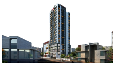
AALISHAN ARCADE / AALISHAN SQUARE SHOPPING CENTER & RESIDENTIAL THEATRE OPP. MUMBRA STATION (ON GOING PROJECT)