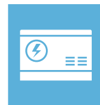
Diesel Power Backup for Common Areas