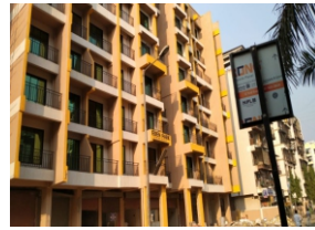
EDEN PARK 7 STORED TOWERS, OPP. METRO STATION TALOJA PROJECT COMPLETED (O.C. RECEIVED)