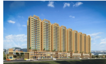
DZCITY 22 STOREY, 3 TOWERS, KAUSA (ON GOING PROJECT)