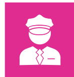
24 X 7 Gated security

Additional amenities that complex your life 14000 Sq.ft. GARDEN