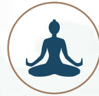
The Meditation Zone