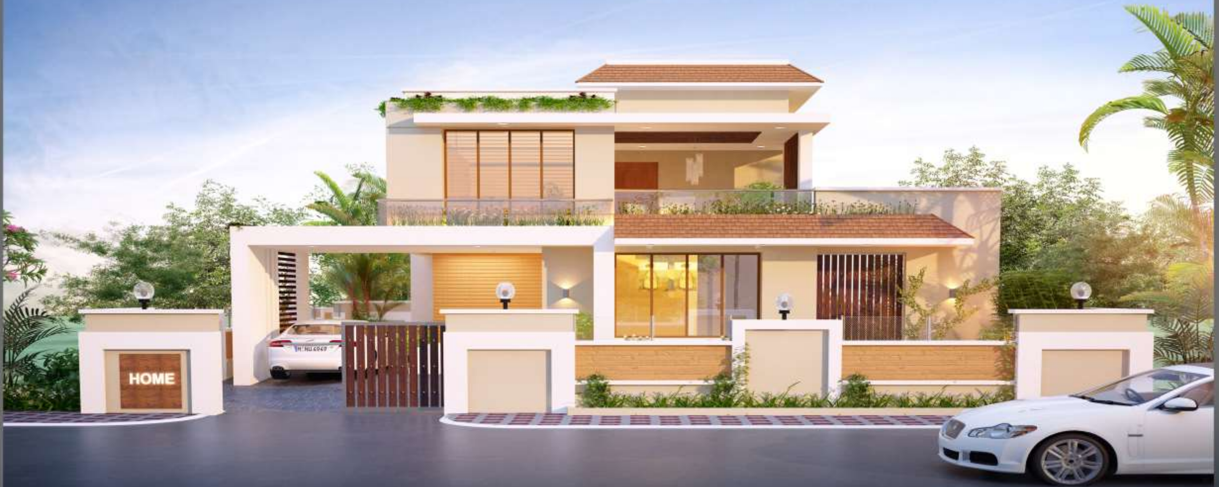
Actual 3D rendered image