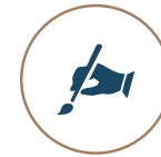
The Art Corner