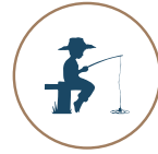
The Fishing Zone