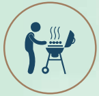
The Barbecue Zone