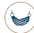
The Hammock Corner