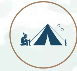
The Camping Zone