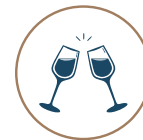
The Party Lawn