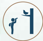
The Birdwatch ing Zone