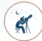
The Astronomy Deck