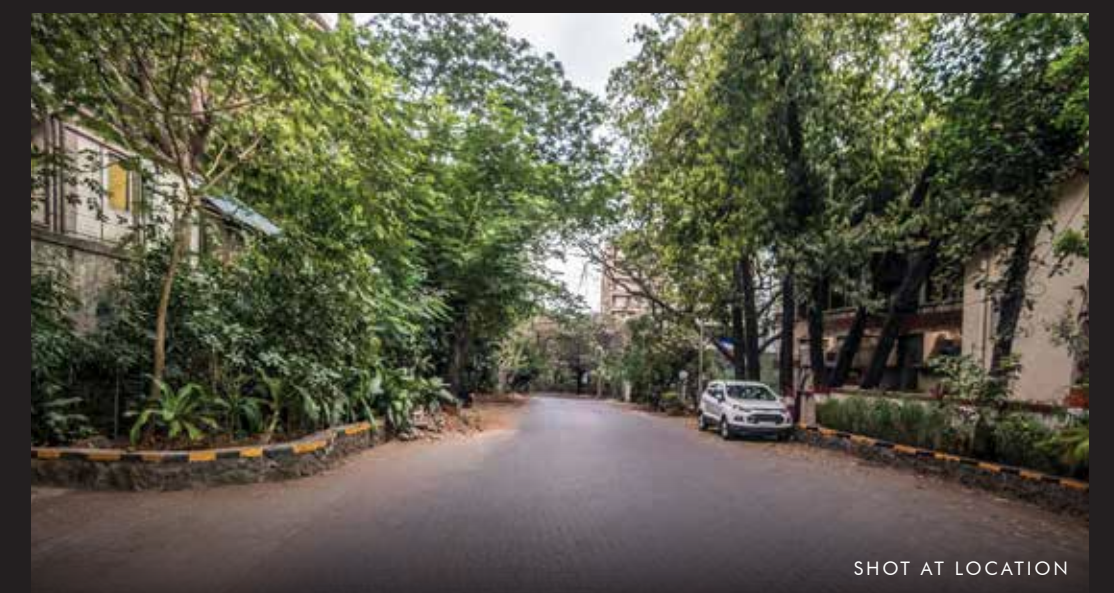
SHOT AT LOCATION