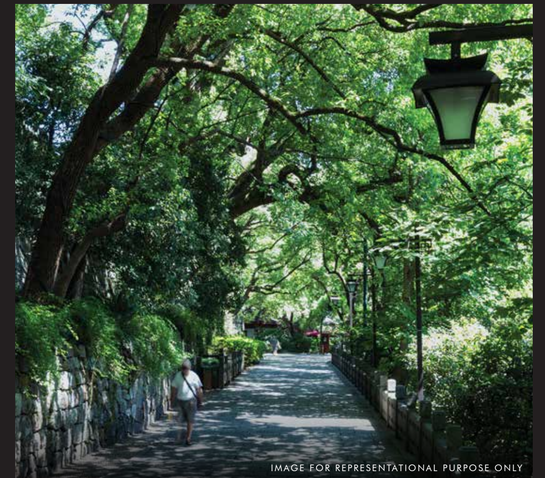
IMAGE FOR REPRESENTATIONAL PURPOSE ONLY