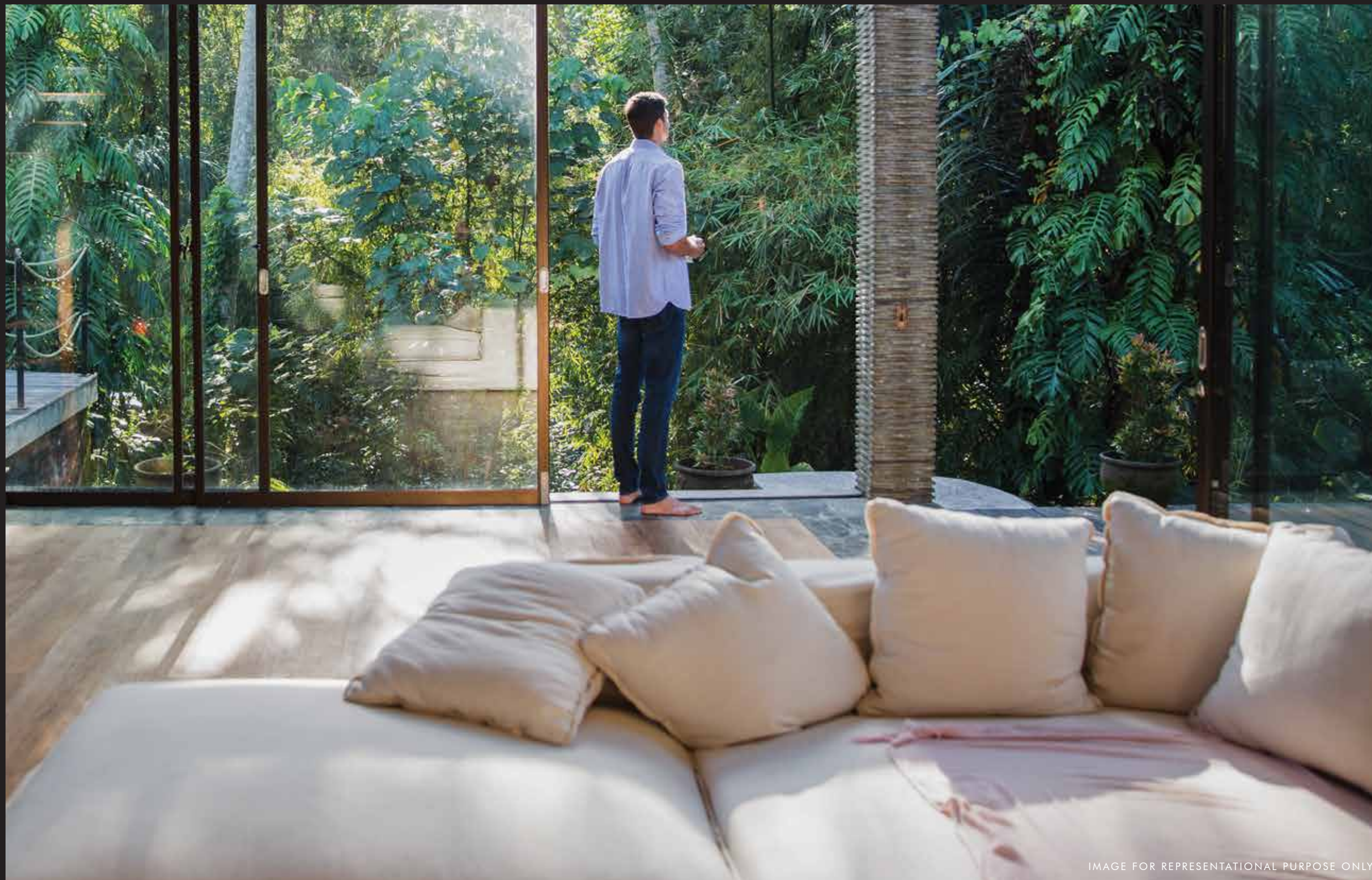
IMAGE FOR REPRESENTATIONAL PURPOSE ONLY

Yet, amidst this idyllic setting, the neighborhood pulses with vibrant energy. Here, the best of Bandra is just around the corner- be it gourmet dining, trendy cafés, or unique creative experiences. At Pali Hill, you're not just a resident of modern-day Mumbai; you're also a part of the enduring legacy of Bombay that remains the charm of this historic city.