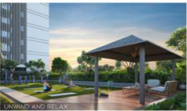
UNWIND AND RELAX