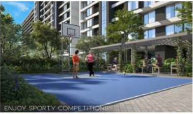
ENJOY SPORTY COMPETITIONS