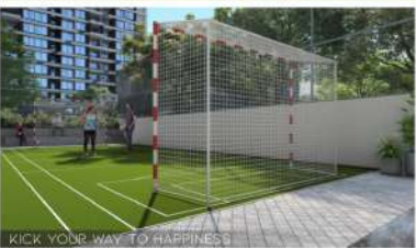
KICK YOUR WAY TO HAPPINESS