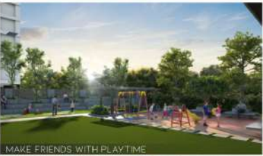
MAKE FRIENDS WITH PLAYTIME