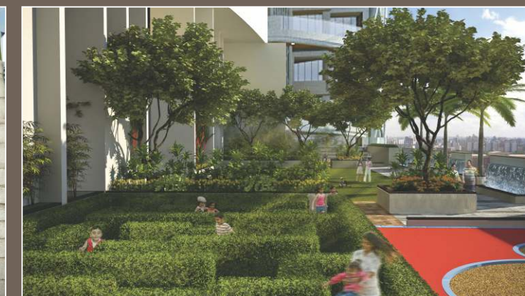
Labyrinth on Podium

CLASSY AMENITIES & SPECS TO LIFT YOUR SPIRITS