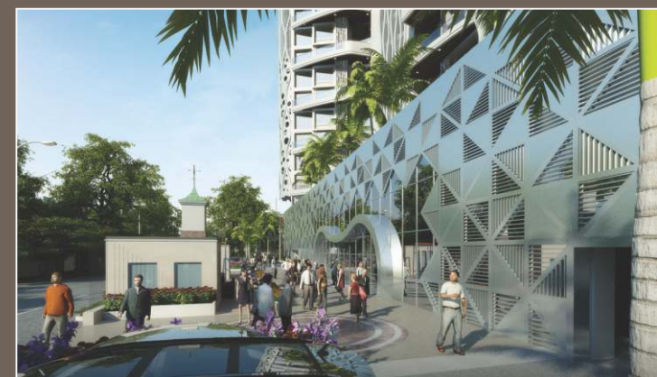
Entrance lobby with Kids Pick n drop area & clock tower