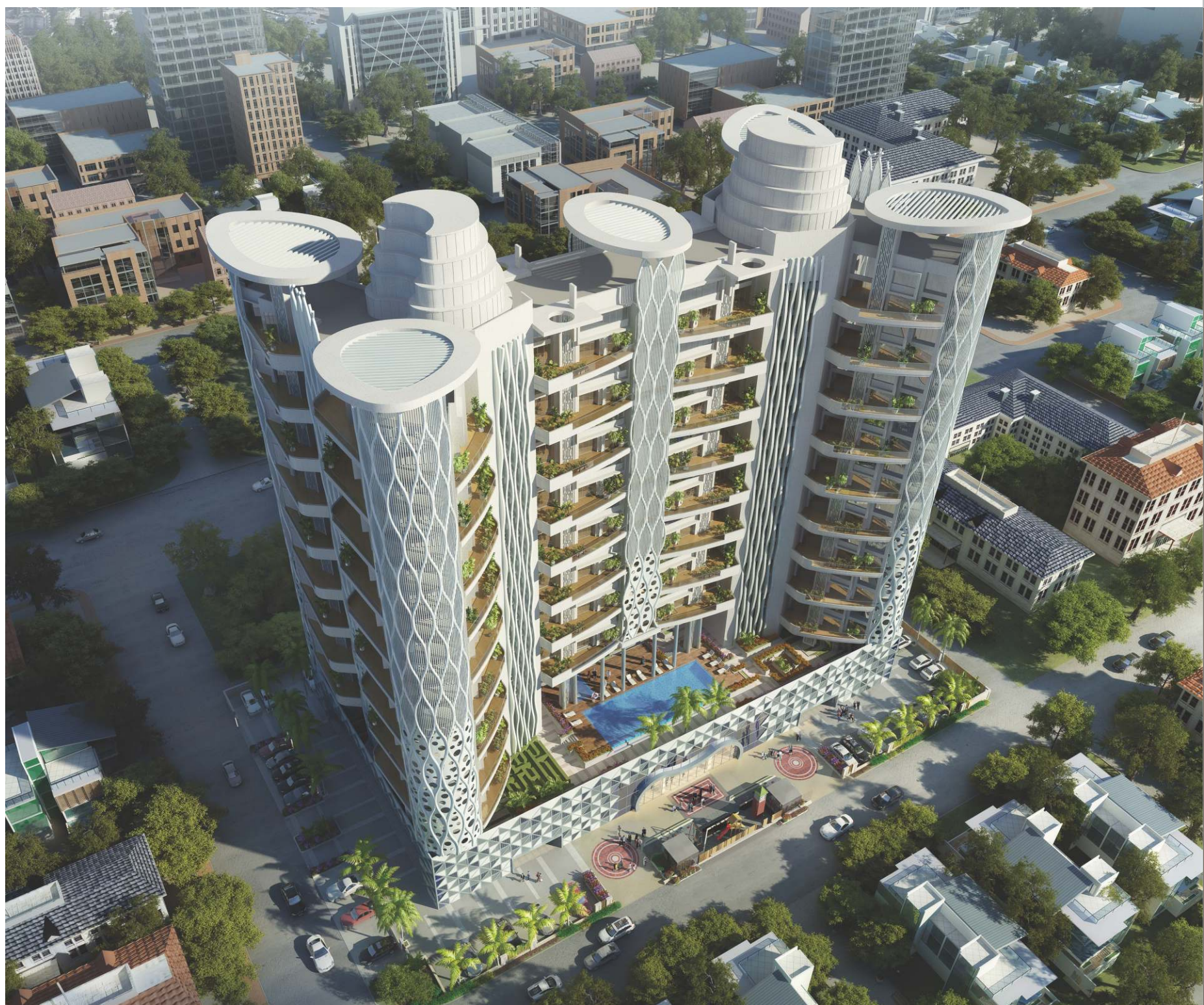
Infinity Pool with kids Pool