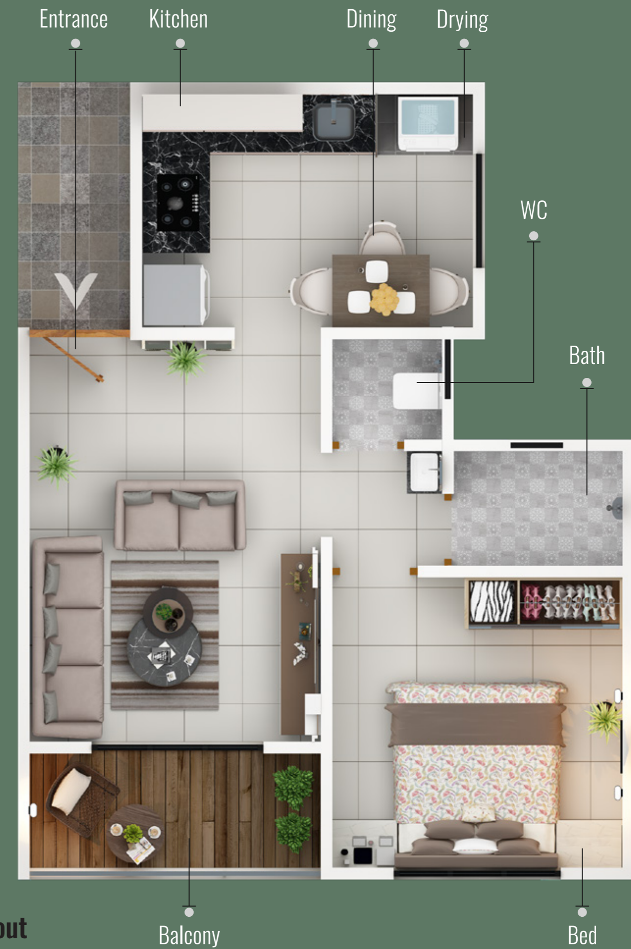
1-BHK Furniture Layout B Wing