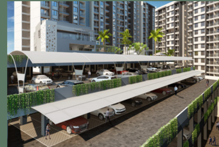
PODIUM PARKING WITH LIFT