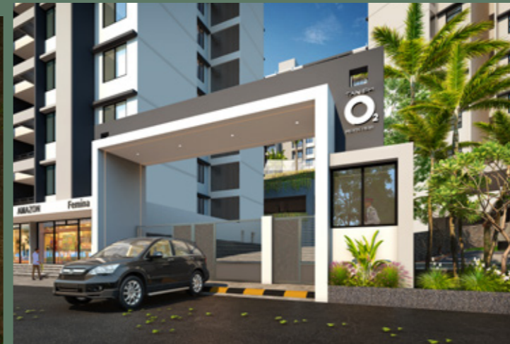
ELEGANT ENTRANCE GATE