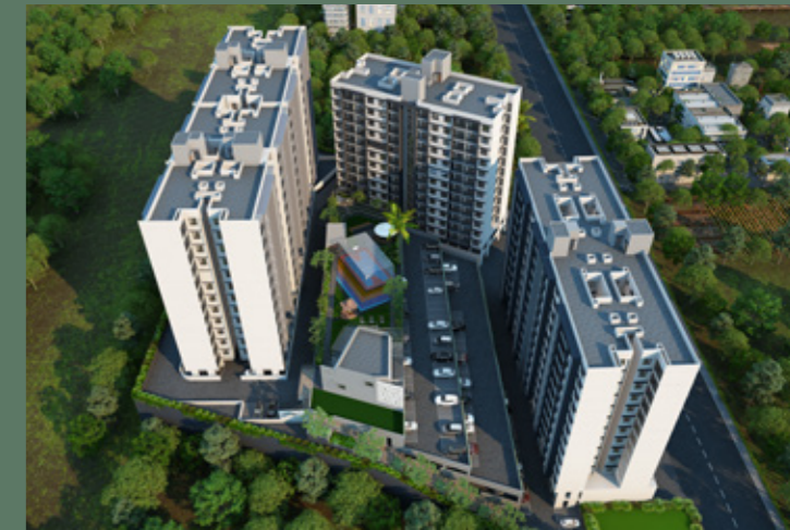
ELEVATED PODIUM WITH AMENITIES