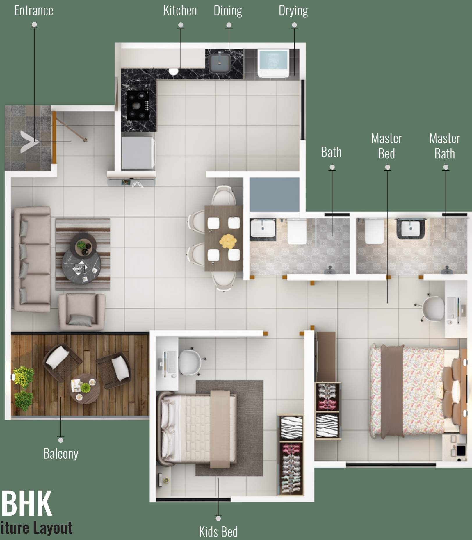
2-BHK Furniture Layout A Wing