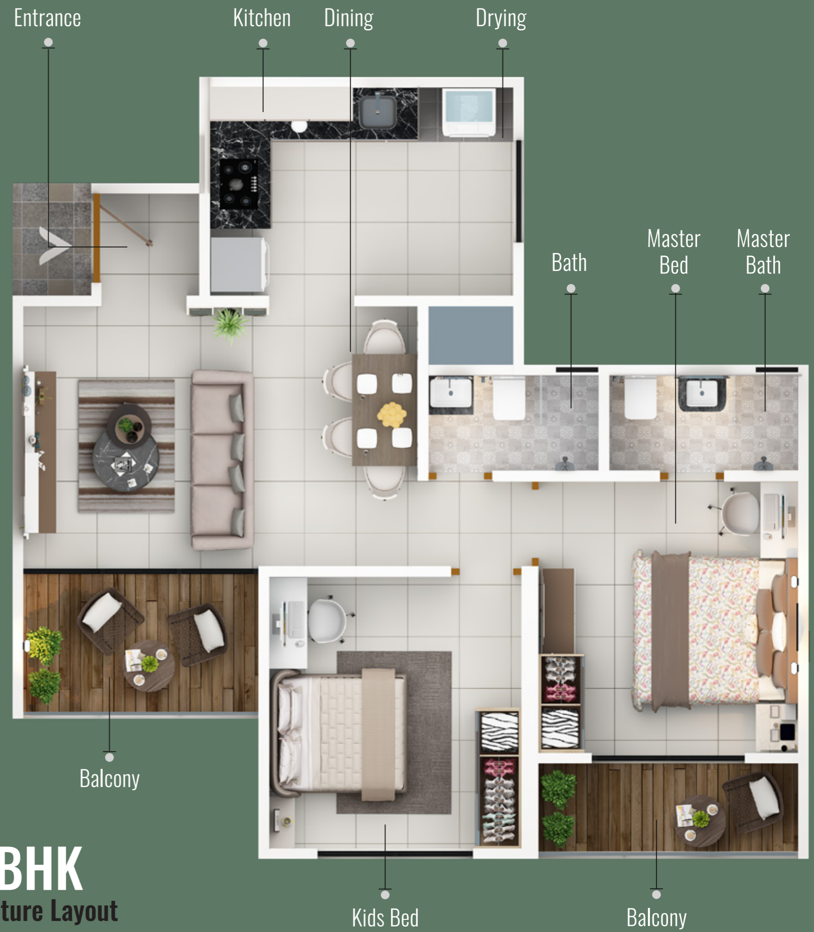
2-BHK Furniture Layout C&D Wing