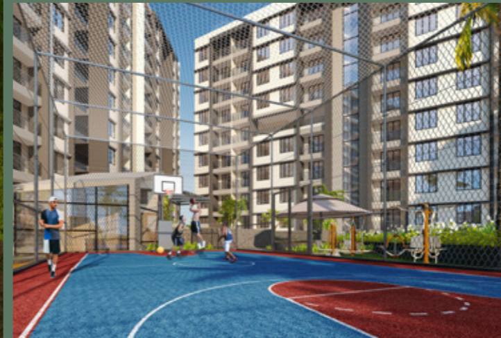
MULTI PURPOSE SPORTS ARENA