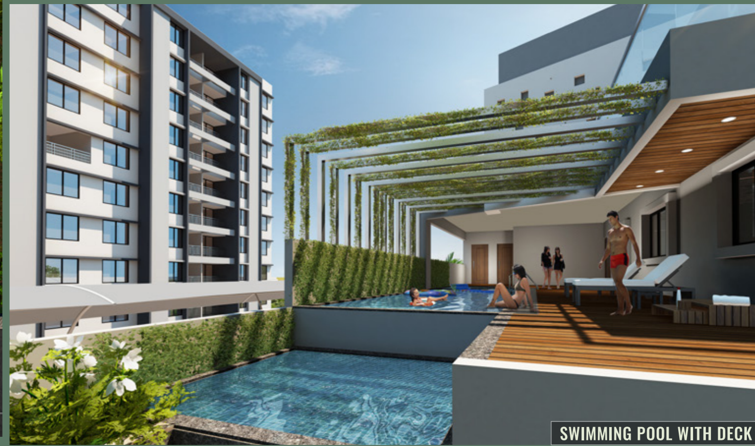
SWIMMING POOL WITH DECK