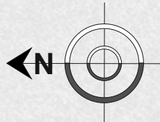
1st,2nd & 3rd FLOOR PLAN