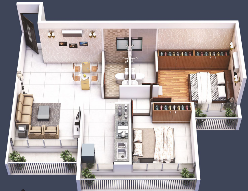
ISOMETRIC VIEW 2 BHK FLAT