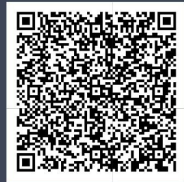
RERA QR CODE