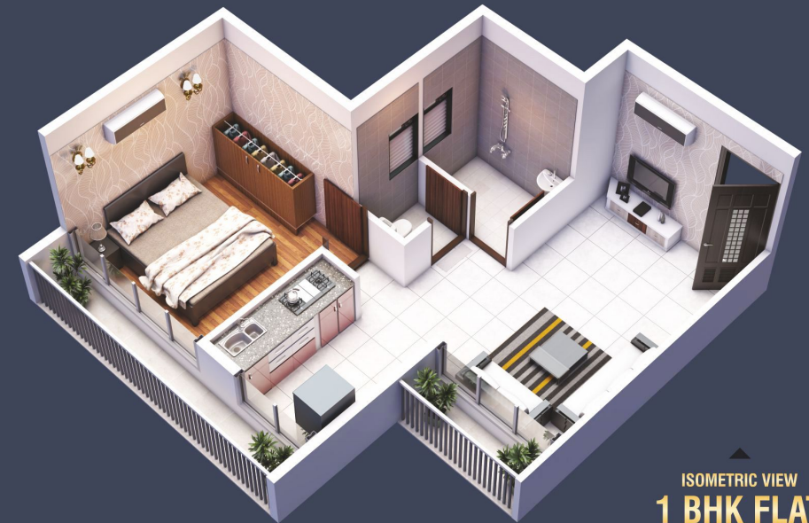
ISOMETRIC VIEW 1 BHK FLAT

Immerse yourself in elegance with ceramic tiles in the dado, elevating the beauty of your private oasis. Revel in perfection with concealed plumbing, premium CP, and sanitary fittings, reflecting the higher calling of sophistication.