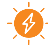
Hidden Underground Power Cables