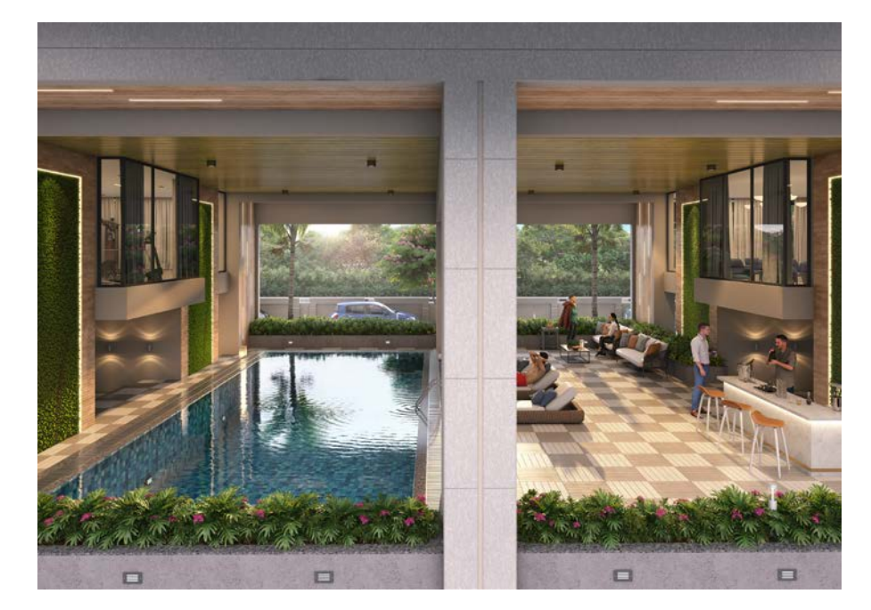
Temperature controlled swimming pool with kids' pool