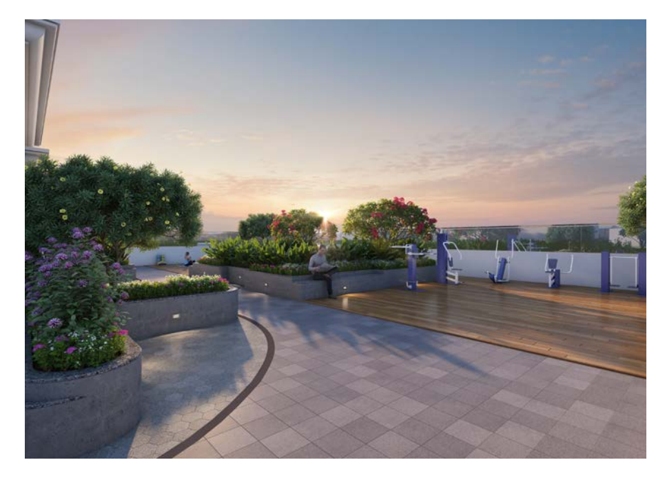
Outdoor exercise station