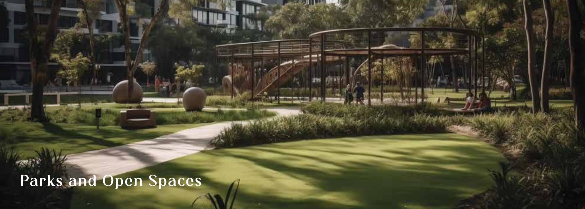
Parks and Open Spaces