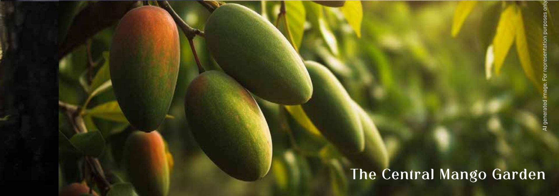
The Central Mango Garden

AI generated image. For representation purposes only.