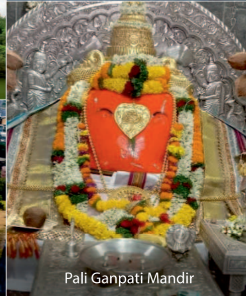
Pali Ganpati Mandir