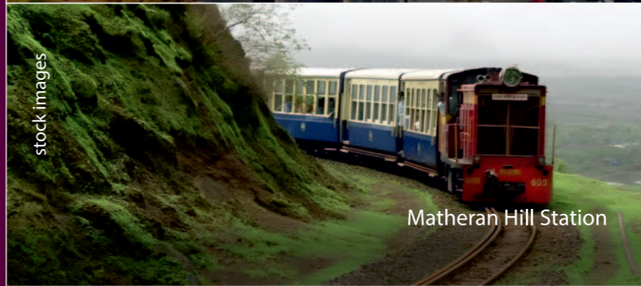
Matheran Hill Station