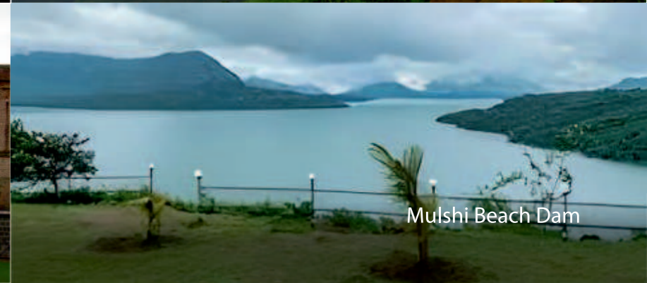
Mulshi Beach Dam