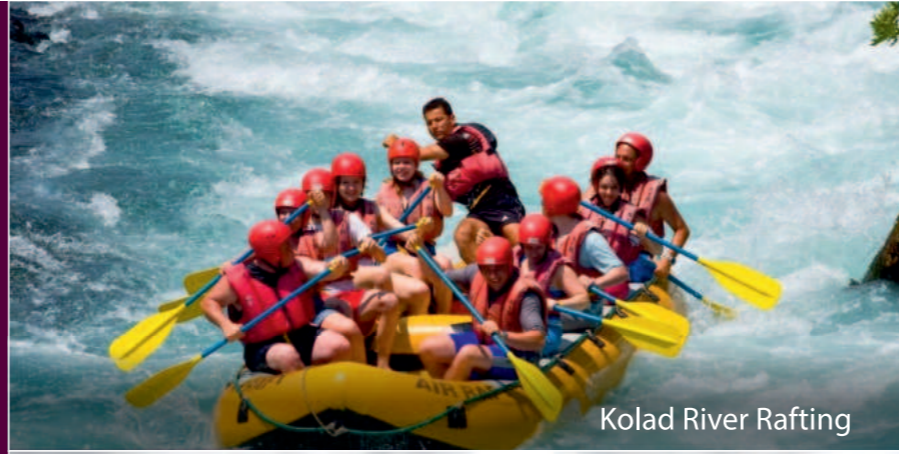
Kolad River Rafting