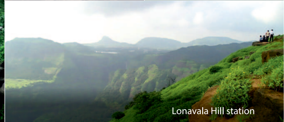
Lonavala Hill station