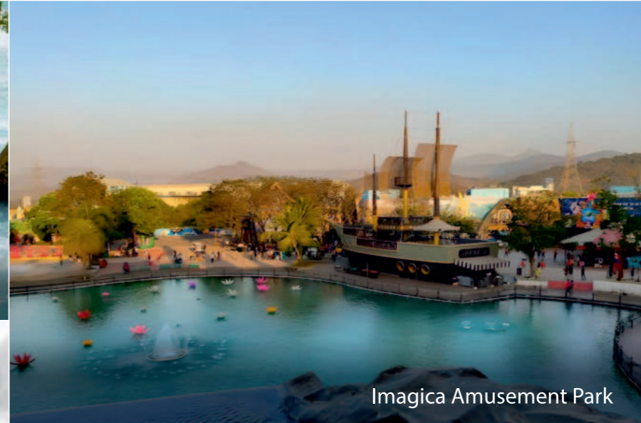
Imagica Amusement Park